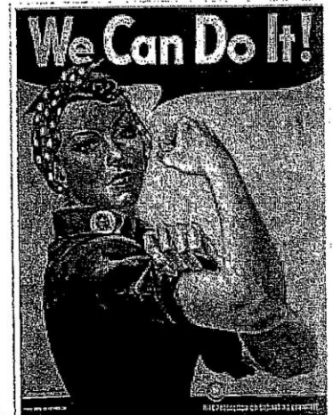
Rosie the Riveter: "We Can Do It!" - Many women first found economic strength in World War II-era manufacturing jobs.

In 1940, only 10% of women who worked were employed by factories, but by 1944, the figure was up to 30%. Although pay was not always equal (the average man working in a wartime plant was paid $54.65 per week, while women on average were paid $31.21 per week), and conditions were sometimes very poor, women quickly responded to Rosie the Riveter, who convinced them they had a patriotic duty to enter the workforce. Some claim that she forever opened up the workforce for women, but others dispute that point, noting that many women were discharged after the war and the jobs given to returning