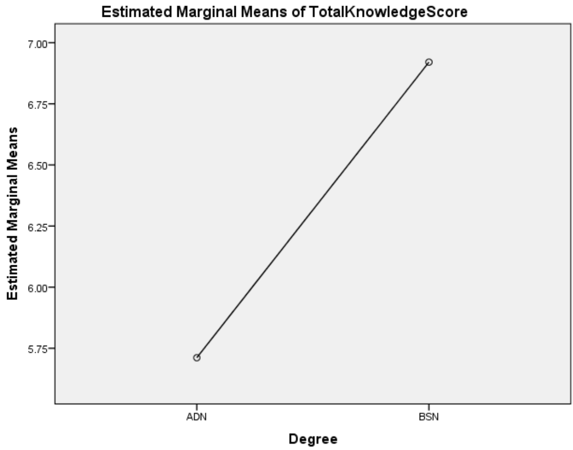
Figure 4.1 Total Knowledge Score by Nursing Degree