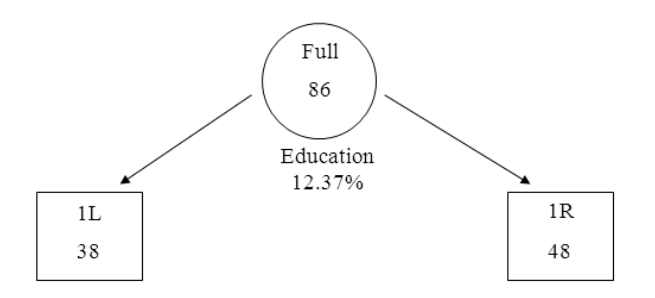
Notes: Square nodes denote terminal nodes; the number inside each is the number of observations/countries in that node. Underneath the non-terminal (circular) node is the level of the variable chosen for that split; nodes to the left contain observations that are less than or equal to the given value.

(of the population that has achieved some secondary education), approximately the level of Spain in 1970, with 48 countries above this level and 38 countries below it.<sup>20</sup> This split occurs approximately at the full-sample mean ratio of the population that has attained some secondary education of 12.42% (see Table A.5 in the Appendix) but below the median of 16.88%. The regression tree technique splits the sample further, but these additional splits were deemed insignificant by the cross-validation proce-