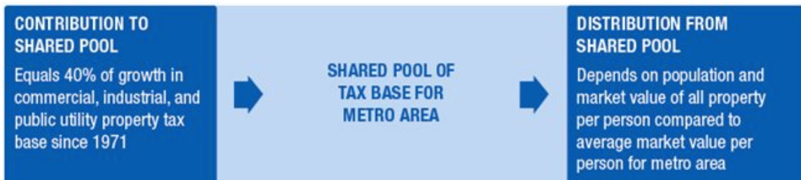
Figure 5: Twin Cities Fiscal Disparities Tax-Base Sharing Program

Minneapolis-St. Paul, Minnesota’s metropolitan area, is the only other comparable regional governing body that provides region-wide services and has policy-review power. The main difference between Portland and Minneapolis, to their advantage, is their “Fiscal Disparities Program” regional revenue sharing system that pools and redistributes 40 percent of total local revenues amongst all city governments in