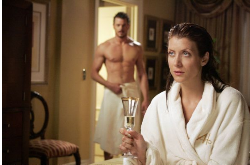
Dr. Addison Montgomery

Female immorality and its repercussions, especially upon the domestic and children, has long been a source of fascination for melodrama authors and audiences. Those women who do not ascribe to the Cult of True Womanhood's four tenets of piety, purity, submissiveness, and domesticity in melodrama often face punishment from the outside forces under which they suffer. 49 As melodrama concerns itself most with the domestic sphere, often that suffering involves dissatisfaction at home. Due to improper behavior, they may have trouble keeping a partner or, or in addition, having a happy relationship with their children. In texts considered here, actions not condoned by the Cult of True Womanhood—even if they occurred in one's past—are tied to infertility.