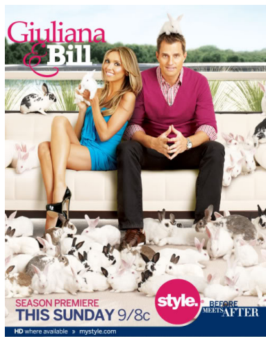
Promotional poster for Giuliana & Bill season two.

Fertility treatments are long, intensive processes that consume a great deal of mental and physical energy, as well as time. When a couple undergoing treatment has cameras rolling, infertility then can take up a good amount of that footage. Giuliana and Bill Rancic's infertility problems arose in the show's second season and quickly dominated much of the show, to the point that it became part of the marketing platform. On Keeping Up with the Kardashians , Khloé & Lamar , and other Kardashian-centered programs, the stress of Khloé and Lamar not conceiving dominated many episodes until the end of that marriage.