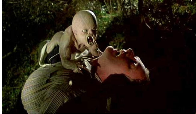
It's Alive (1974)

Returning to Foucault, in his conception of the “socialization of procreative behavior....the conjugal couple was given both medical and social responsibilities.” If not followed, potential results could be “the production of sexual perverts or genetic mutants.” 36 So beyond the persistent social stigma of “barrenness,” women undergoing fertility treatments must also combat the fear of “mutants” that may result from their unnatural generation. In It's Alive , as in so many popular culture texts, these abnormalities are the fault of the mother—infertility is positioned as a woman’s problem, with her body having to be “fixed.” In horror, too much tampering threatens not just her own body, but also those bodies around her when monstrous, mutant offspring result.