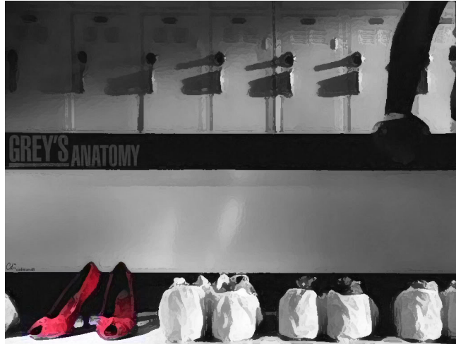
Grey's Anatomy opening credit sequence

One female character from the show, Dr. Addison Montgomery, spun off to her own program, Private Practice (2007-2013). 41 Montgomery's departure stemmed directly from her desire to get pregnant, which took her to work alongside a fertility specialist in the Los Angeles area. This program also aired on ABC at night, aimed at a female audience, and concerned the lives and loves of numerous doctors. While less popular than Grey's Anatomy , Private Practice also served its network in drawing significant numbers of viewers ages 18-49. 42 Both programs also frequently utilized such melodrama hallmark as characters expressing a great deal of interior feelings, dramatic music cues during discussion of personal matters, and emotional cliffhangers between scenes and episodes.