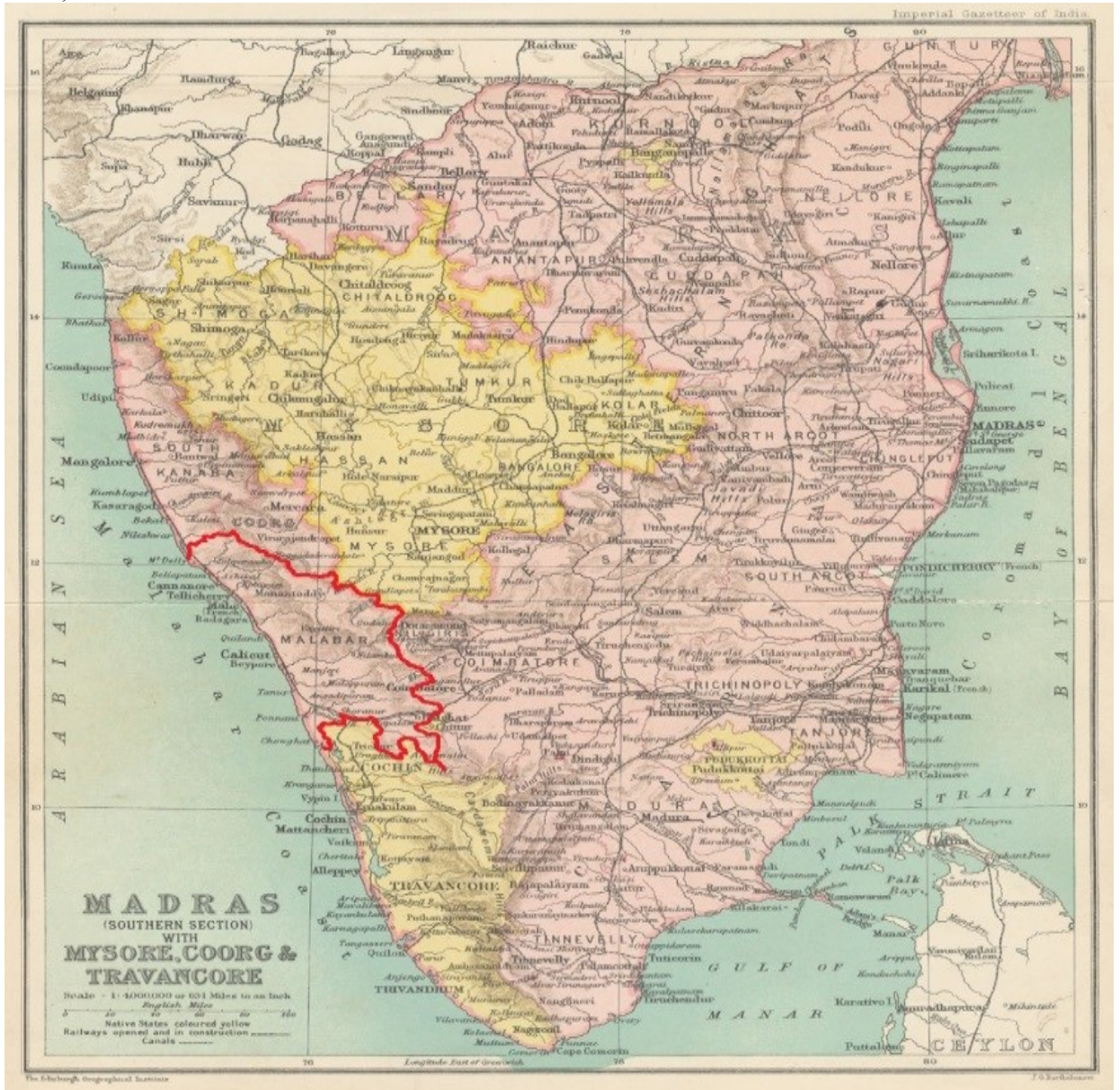
Appendix 5 a: Map of Madras Presidency at the turn of 20 th Century 103 (Bartholomew 1909)

In this map of Southern India, the British administered Madras Presidency is indicated in pink and the district of Malabar is outlined in red on the southwestern end. The Princely States of Travancore and Cochin are marked in yellow underneath the southern boundary of Malabar.