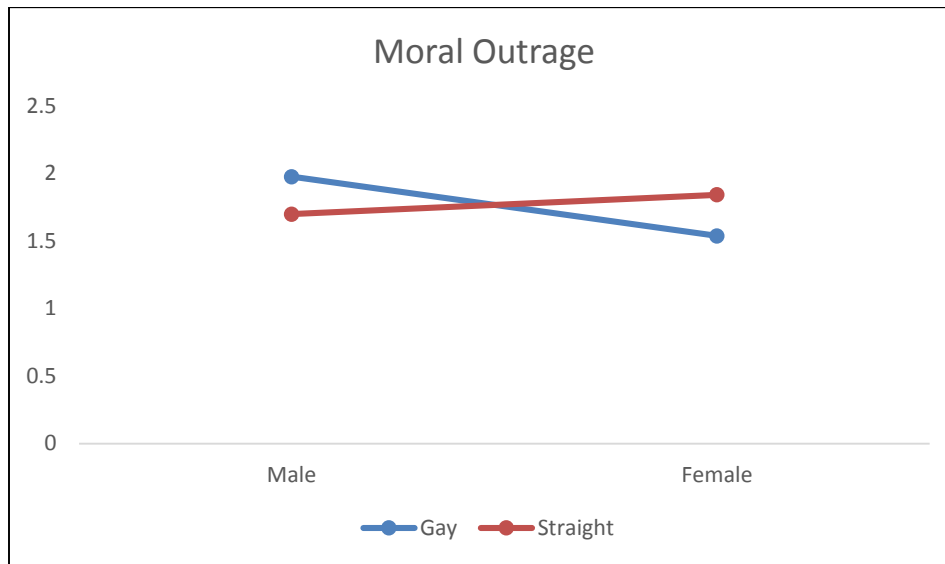
Figure 2. Interaction of Leader Gender and Sexual Orientation in Predicting Moral Outrage

tests (i.e., Tukey) indicate that none of the differences between the four groups were statistically significantly different from each other.