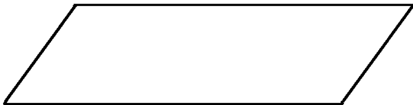
Figure 4.1 Example Student Drawing Response:

More specifically, the errors made by students often went back to one of a few common misconceptions. Student drawings in general should have been a parallelogram, with one set of parallel sides longer than the other set. Figure 4.1 below shows an example of the general shape student drawings would resemble if done correctly, without figures that were included on actual assessments.