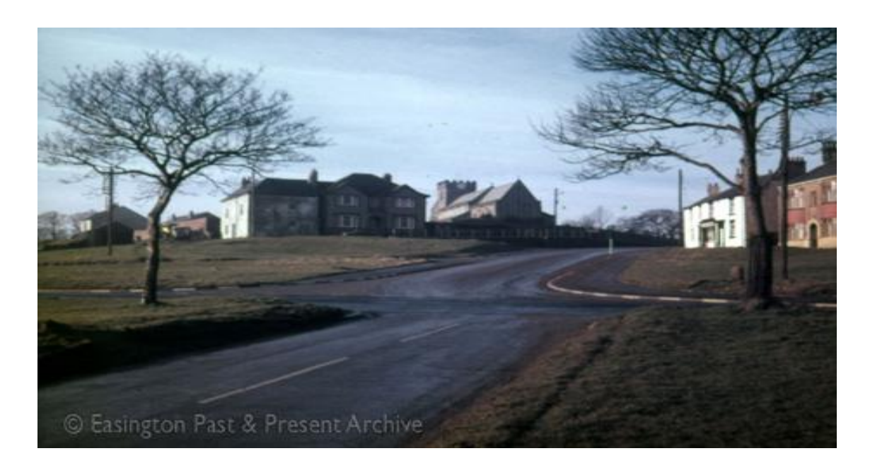
Figure 8 (above): Open, traditional village lay-out of Easington Village

Easington Colliery lies south of Seaham's Heritage Coastline, however little is made of this fact. The former pit site has been reclaimed but rather than providing a site for development or enterprise it is simply greened over with a small park (figure 9, below) to commemorate those who lost their lives in mining disasters over the years. Little new development has taken place in Easington Colliery, and the neighbourhood is more familiar with low demand and housing demolition than new build (see, for example, Beynon, at al., 1999; Easington District Council, 2002; Easington District Council, 2007). In addition no employment came in to replace the lost mining industry and the vast majority of the businesses on Seaside Lane (the main street and once thriving shopping centre for the colliery) closed. This resulted in the community becoming less centred on the Colliery village itself to provide employment, retail and social facilities. The neighbourhood was fractured further when coal board houses (the colliery tied terraced properties which make up the colliery settlement) were sold off in bundles. These properties were often bought by people outside the area and have led to wider problems associated with absentee landlords (discussed later in the thesis). As a result Easington Colliery struggles to shake the stigma associated with industrial decline and post-mining malaise.