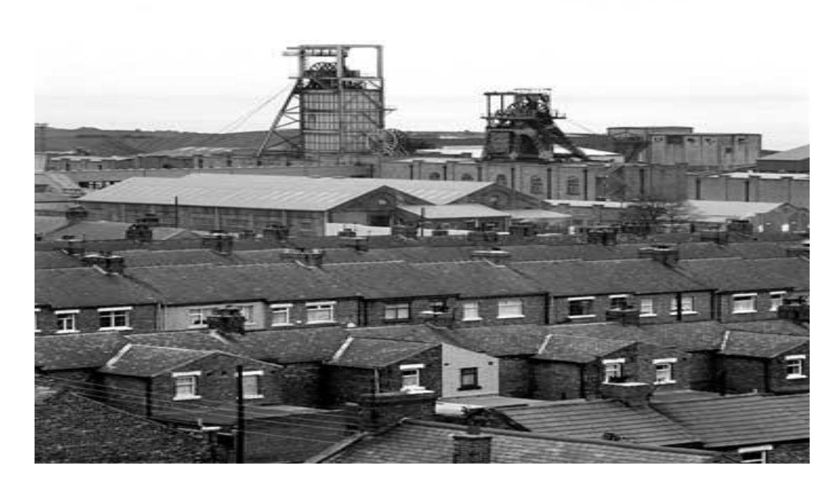
Figure 7b (above): Closely built, grid pattern of housing built to serve the pit at Easington Colliery, taken in 1992.