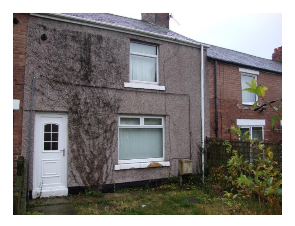
Figure 11a (above): An example of Group Repair work in Wembley, Easington Colliery: Noble Street before Group Repair

In-line with other Neo-liberal agendas of partnership working, this scheme has been accompanied by the creation of steering groups, used to bring communities and stakeholders together to work through issues of concern in those areas. This is discussed in greater depth in Chapter 7, however it is necessary to note that the use of steering groups has opened up the agenda, making the communities feel more included in a process which is ultimately affected them. In turn this also facilitated a greater degree of success for the Group Repair agenda, from the communities at least.