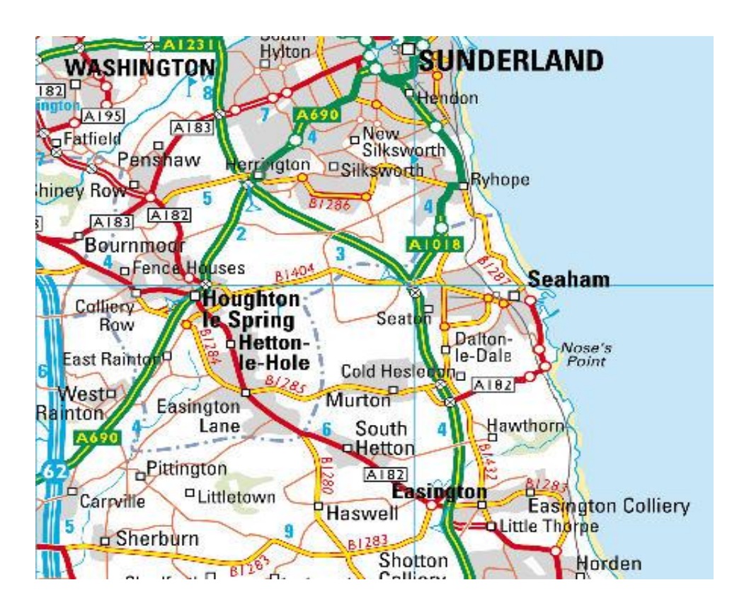
Figure 1b: Road Map of East Durham

Consisting of a series of colliery villages and towns separated by fields, East Durham experienced post-industrial problems in a rural setting--rather appropriately described by a third sector interviewee as experiencing 'urban deprivation with hedgerows' (Interview HH). It is this 'special characteristic' of settlement patterns observed in coalfield villages (Coates and Barratt Brown, 1997) which Williamson (1982: 6) contends must be regarded as 'constructed communities' which