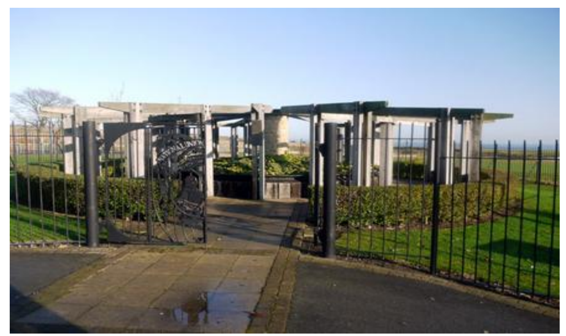
Figure 9 (above): the entrance to the former pit site, Easington Colliery, in which a small commemorative garden has been erected to the miners of the colliery

Easington Colliery today has a population of approximately 5,000. Low levels of earnings, low aspirations, low skill levels and poor health have created, according to Durham County Council (2010), a neighbourhood with high levels of multiple deprivation- with 18% of the population of working age claiming incapacity benefits, and the majority of houses falling within Council Tax band A (DCC, 2010 Private Sector Housing Strategy For County Durham 2011- 2015, draft). Easington Colliery, along with neighbouring mining areas of Wheatley Hill and Dawdon, is a focus for housing renewal work on existing housing stock in East Durham - identified as 'regeneration hotspots' by Durham County Council during the local government restructure in 2009 (Interview D). Interestingly these villages are not those which were marked out as 'Category D' settlements<sup>7</sup> in the 1951 Durham County Development Plan (see Chapter 2).