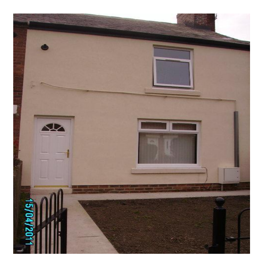
Figure 11b: An example of Group Repair work in Wembley, Easington Colliery: Noble Street after Group Repair

Overall the research uncovered support for Group Repair across a range of respondents. There was a general consensus that the programme was effective, providing some "absolutely fantastic examples across the county" (BB) in pre 1919 stock. As such it was regarded as a valuable policy which not only improved the aesthetics of the physical environment but also influenced the perceptions of the area making the houses and wider neighbourhood more attractive to potential and current residents. This is a subjective notion however as a lack of data on the specifics related to the scheme, i.e. empty homes, meant that it was impossible to categorically state that group repair had improved "let-ability" in the targeted areas- a point highlighted by a local authority housing specialist (Interview FF). The focus of the scheme on the physicality of the neighbourhood promoted most discontent. A local councillor who suggest that face lift programmes are "all well and good" but believe a more strategic approach is needed to "tidy up the colliery" which should focus on "bring[ing] in better housing" (Interview P). One such interviewee suggested that Group Repair focuses too much on the aesthetics of the