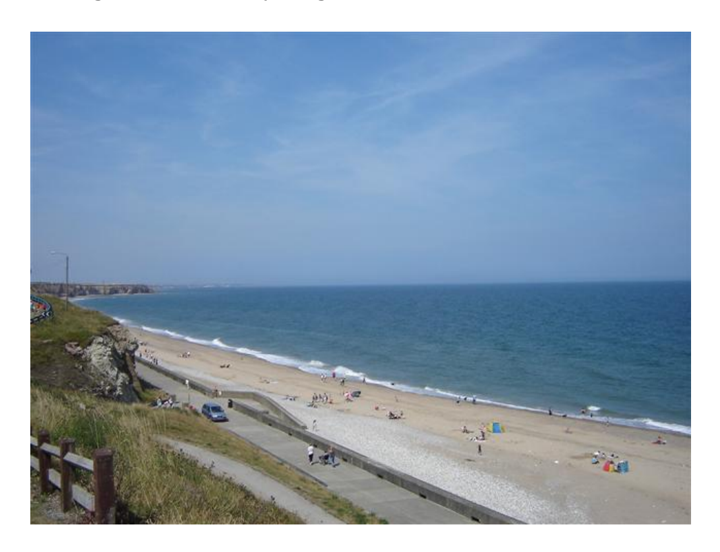
Figure 2: Seaham's Heritage Coastline

bestowed on the town by the former District Council and now the Unitary local authority, has helped and guided Seaham through the issues associated with industrial decline. Seaham, situated on an attractive coastline which was regenerated through local, national and European funding, was designated a "heritage coast" in 2001 (see figure 2 below.