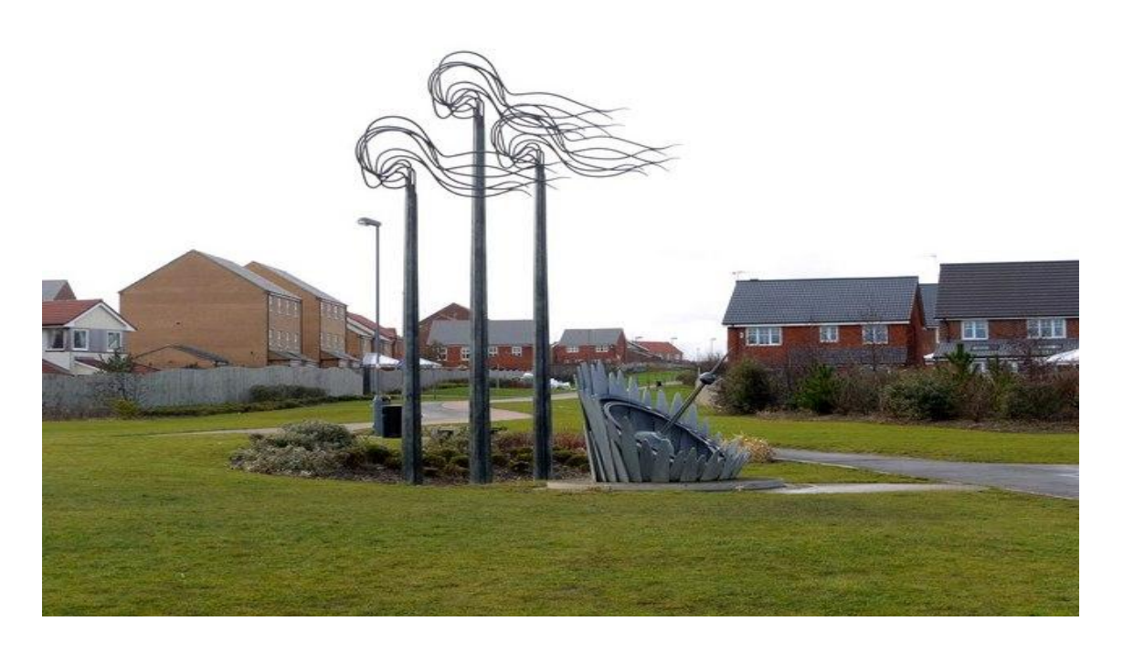
Figure 6a (above): East Shore Village, Seaham. Once the site of Vane Tempest Colliery, today a large scale housing development