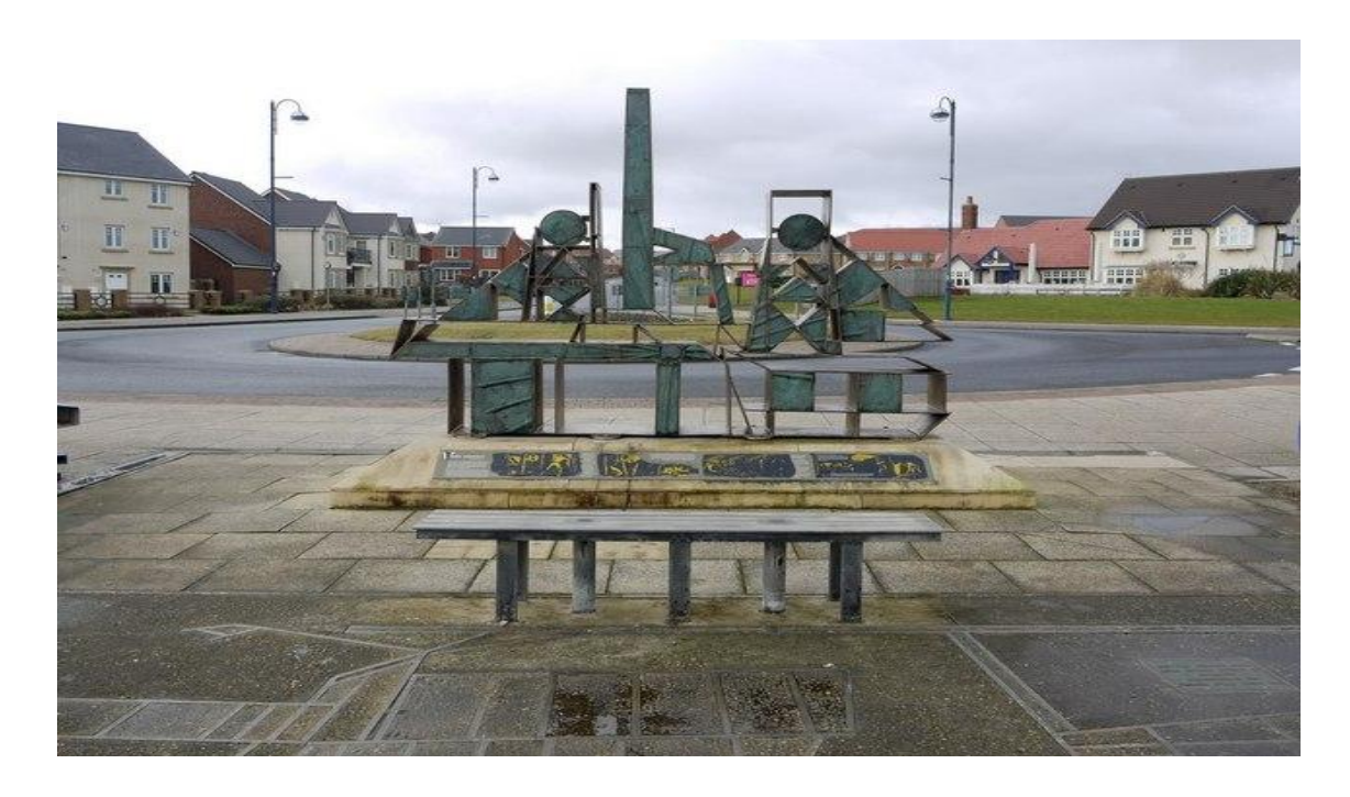
Figure 6b (above): East Shore Village, Seaham. A sculpture of Vane Tempest Colliery pays respect to the industrial heritage of the area

This programme of funding and place based investment has borne fruit, and Seaham is now one of the most successful centres within East Durham and the