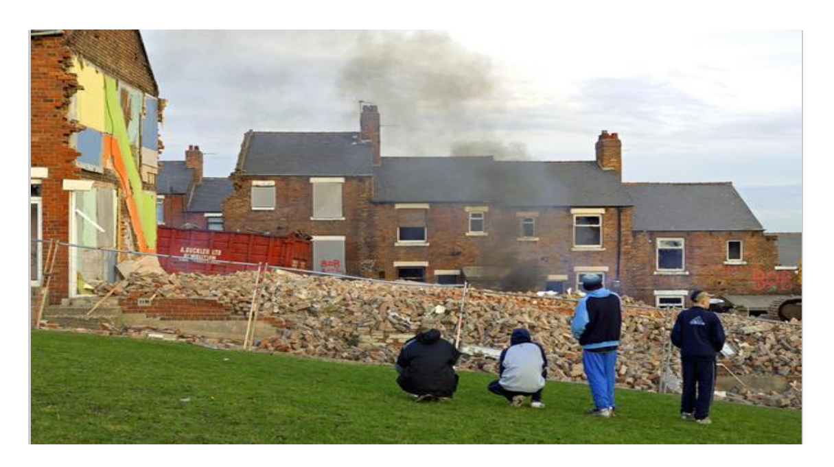
Figure 10: Demolition of Andrew and Alnwick Street ('B' Streets), Easington Colliery 2003. (Copyright 'Farwell Squalor' by Sally-Ann Norman)

measures are required to solve the problems associated with pit closures and the mass selling of colliery housing which, it was argued, was carried out with a lack of forethought for the community. this process meant that housing and the physical fabric of the community deteriorated, leading to redlining when the majority of housing developers rejected Easington Colliery as a neighbourhood to build properties in both slump and boom housing market periods. Evidently-- and supporting Smith's theory-- this resulted in the abandonment of properties, which created numerous void and vacant dwellings, some of which were subject to demolition (see figure 10, below) as part of the housing market restructuring of East Durham.