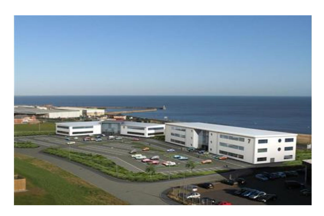
Figure 4 (above): Seaham Spectrum Business Park; Enterprise Zone in East Durham

Situated 6 miles south of the City of Sunderland and 13 miles east of Durham City, the town of Seaham owes much of its history to the port (Seaham Harbour) which