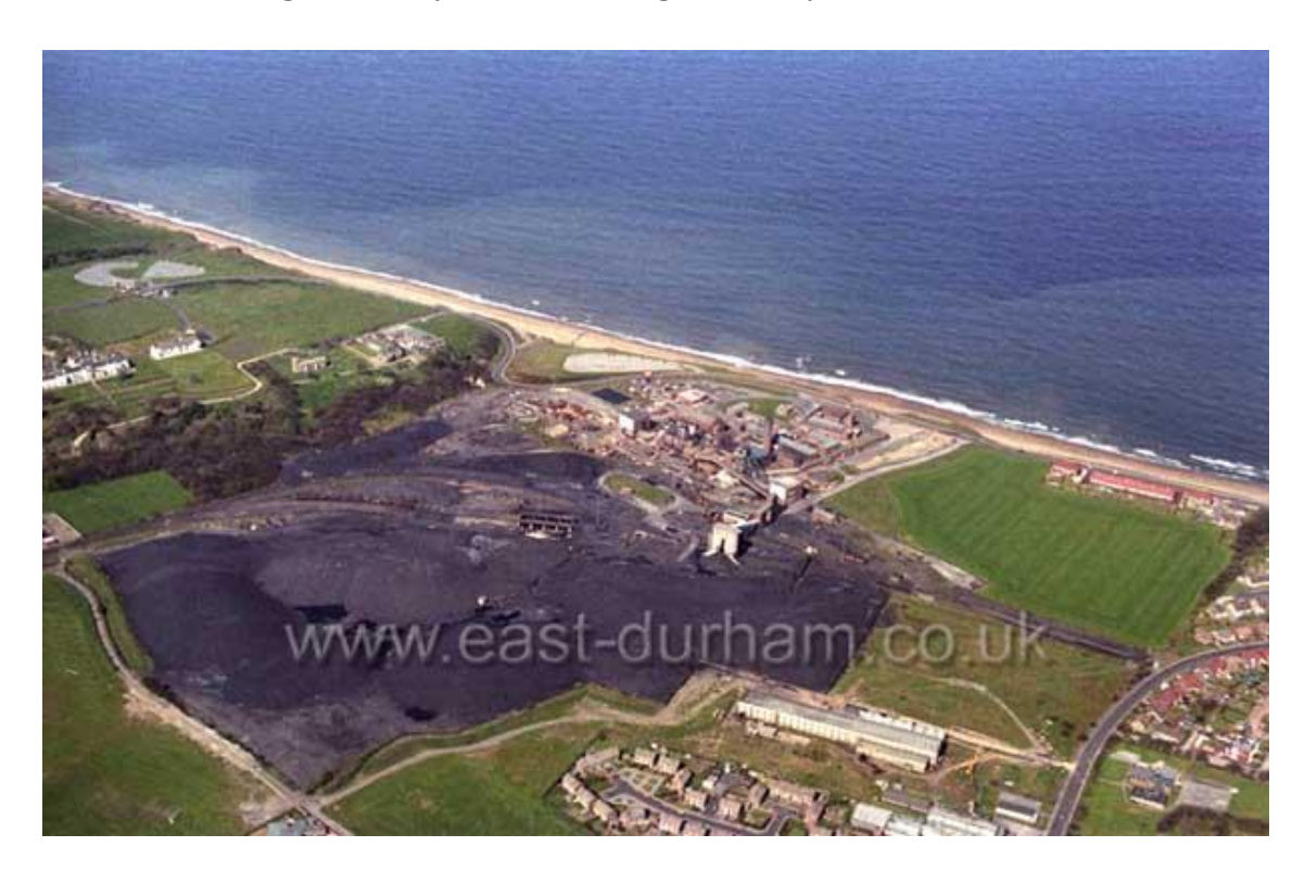
Figure 5 (above): Vane Tempest Colliery, Seaham. This land was reclaimed and redeveloped after the colliery ceased production, and now is home to East Shore Village

gave the dwelling its name. A tiny fishing hamlet at the beginning of the 19<sup>th</sup> century, Seaham Harbour was established by Charles Stewart (later the third marquis of Londonderry) who, after marrying Frances Anne Vane-Tempest in 1819, used his wife's wealth to buy the extensive Seaham estate (Pocock and Norris, 1990). The growth of the town resulted from the port which provided an outlet to distribute the locally mined coal to the rest of the country. Seaham Colliery-- referred to locally as 'The Nack'-- opened in 1849. At its height, in 1914, Seaham Colliery employed 3,094, dropping to its lowest rate of 493 in 1980 before combining with Vane Tempest pit in 1988 (Durham Mining Museum). Vane Tempest colliery (figure 5, below) opened in 1926, employing 1,819 at its height in 1950, and closing in 1993 (Durham Mining Museum).