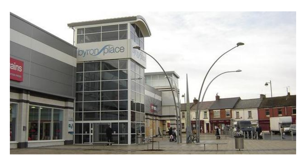
Figure 3 (above): Seaham Byron Place Shopping Centre