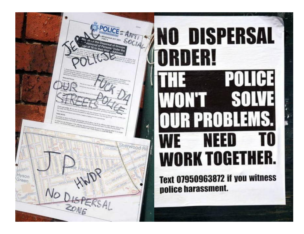
Figure a (Left): Information regarding the recent Dispersal Order in Forest Field covered in Graffiti telling reactions to the issue of the order Figure b (Right): A poster campaign against the Dispersal Order and Police harassment

minority ethnic persons are victims to this operation of spatial control. These findings correspond to Iveson (2007), whereby graffiti-writing is presented as a counterpublic response to governance strategies that increasingly marginalise minority groups.