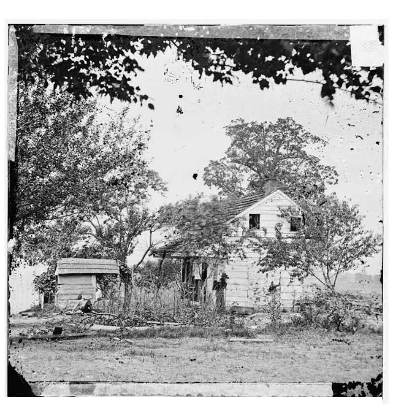
The Brian House in 1863 after the Battle of Gettysburg.

house in town and purchased a farm worth $1,400 on the southern outskirts of Gettysburg where Catharine's daughter Frances grew to adulthood. When the Union and Confederate armies converged at Gettysburg in 1863, the Brians, like many other African-American families in the area,