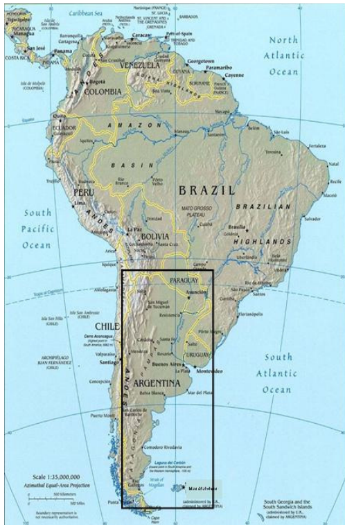
Figure 4.3. Argentina in South America