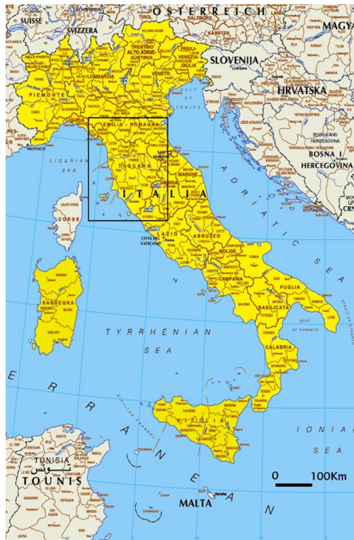
Figure 4.1: Tuscany region in Italy