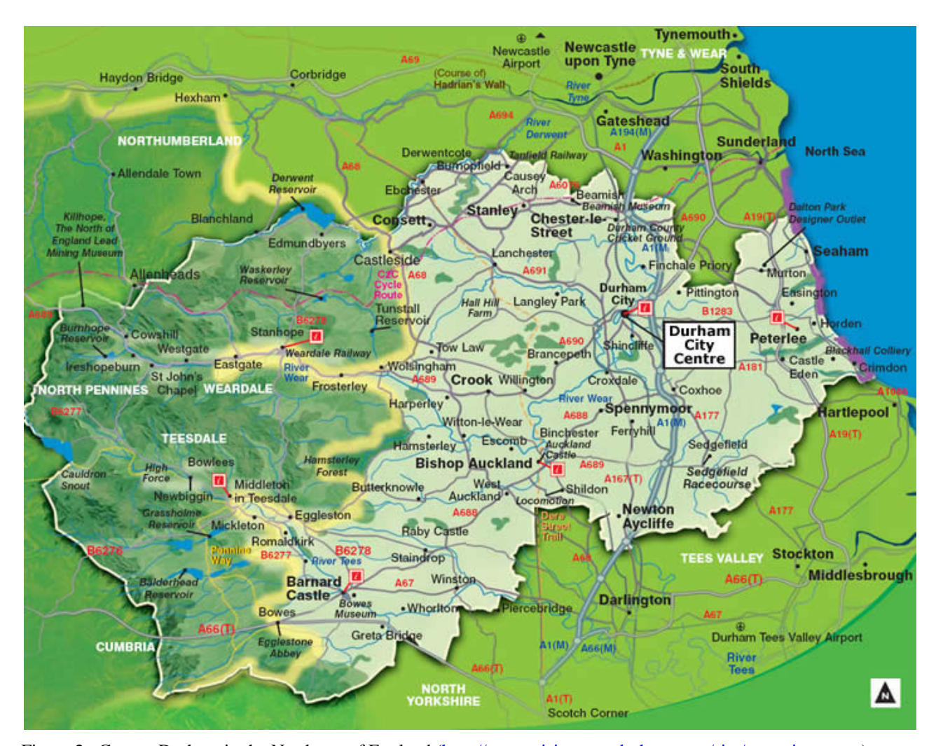
Figure 2: County Durham in the Northeast of England (<a href="http://www.visitcountydurham.com/site/attractions-map">http://www.visitcountydurham.com/site/attractions-map</a>)

For Weardale the locations were: Stanhope, Wolsingham, Rookhope, St. John's Chapel, Witton-le-Wear. For Teesdale the locations were: Gainford, Barnard Castle, Woodland, Copley, Middleton-in-Teesdale. And for Derwentside the locations were: Consett, Delves Lane, Lanchester, Moorside and Tantobie. Of those locations Barnard Castle and Consett are towns, the rest are villages with varying facilities and varying distances to the nearest town (from 2 miles to 28 miles).