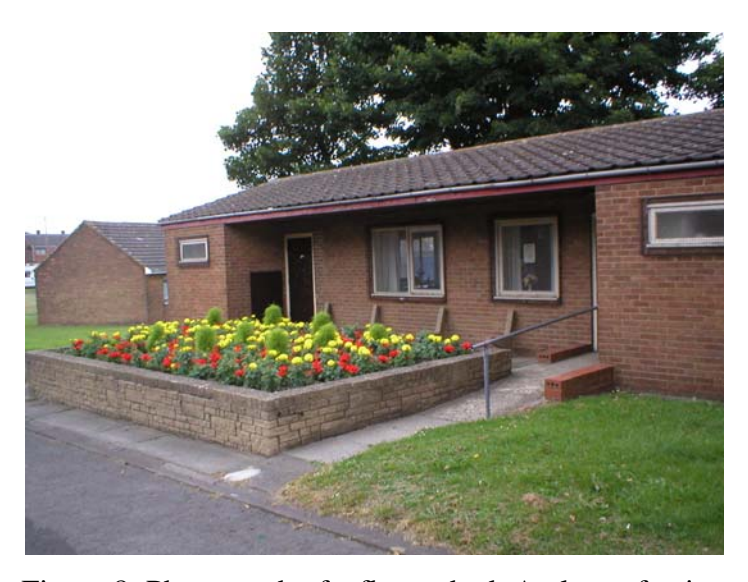
Figure 8: Photograph of a flower bed: A place of enjoyment for participants