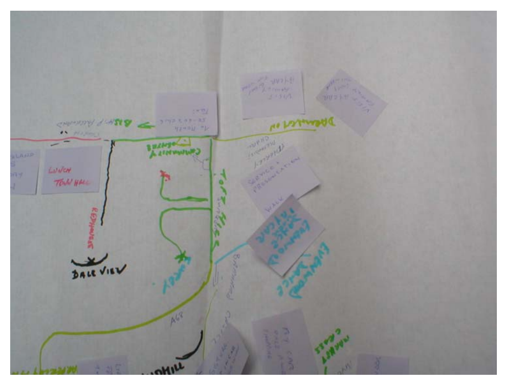
Figure 6: Group Sketch map

Participants subsequently presented the map to the whole group and discussed their part of the drawing. Efficacy and acceptability: The group maps were drawn with different coloured pens by individuals on the same piece of paper. There was no base map, which meant much discussion among the group regarding spatial orientation within the village and of neighbouring villages. The resulting drawing looked somewhat chaotic, with different scales within the drawing as participants had different travel horizons. The discussion of the maps was therefore less successful, as participants could not remember which bit had been part of their drawing. Upon reflection I concluded that a group map would have to be based on a basic scaled map of the area in question.