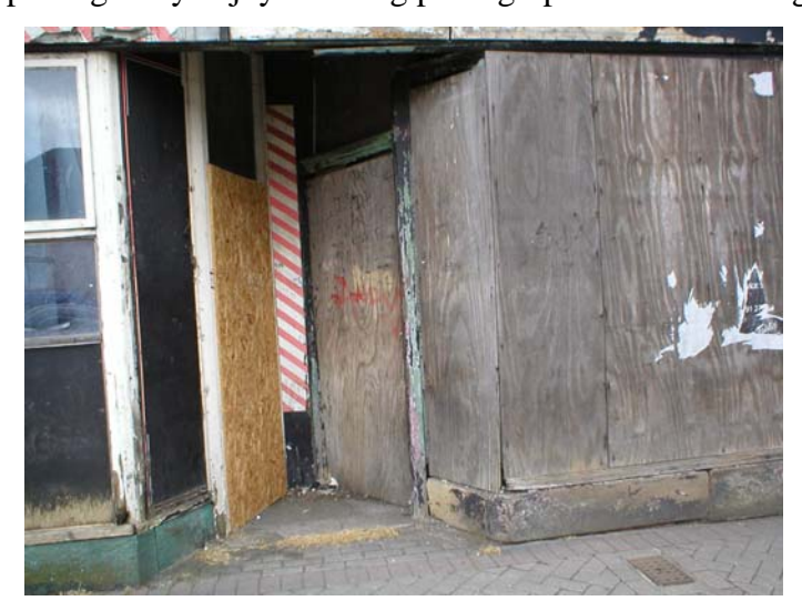
Figure 7: Photograph of boarded-up shop fronts: A place of fear and discomfort for participants

A small group of participants were given a digital camera and asked to take photographs in the village of places and objects, which were important to them. Participants returned with a good number of pictures, explaining their reasons for taking particular shots. Participants tended initially to focus on negative images (figure 7) (probably also because they were not residents of that particular village), but then became themselves aware of their bias and took some positive pictures as well (figure 8). Of the three women who were in the group one took all of the pictures, although the others had some input into which places to photograph. An awareness of group dynamics, in particular dominant individuals is necessary. Not all participants were confident about taking the photographs. They nonetheless had an influence on the objects chosen for photography. Participants greatly enjoyed taking photographs and discussing them with the group.