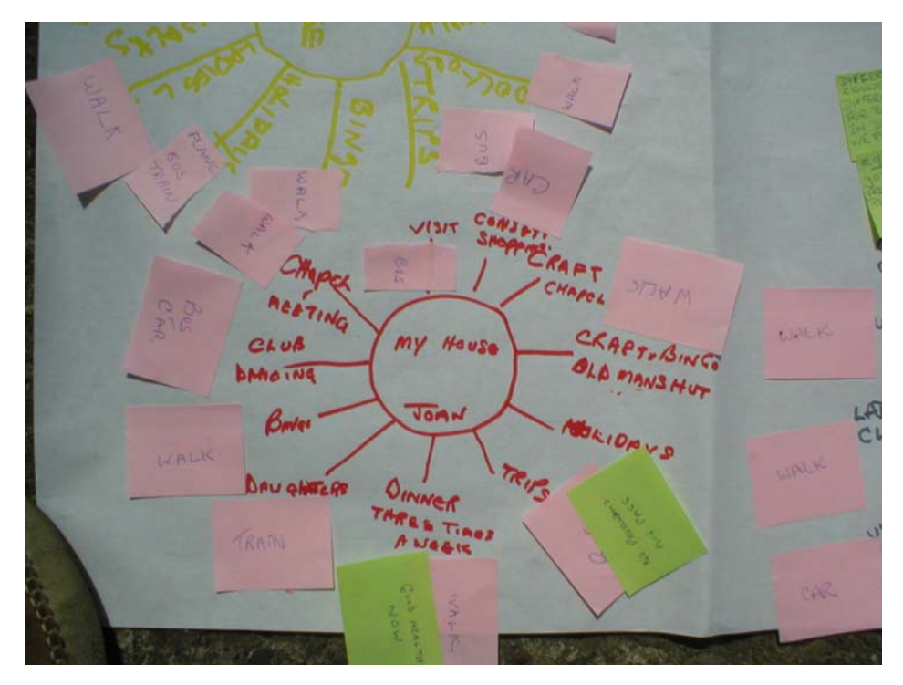
Figure 4: An individual mobility spider diagram

The resulting diagrams were then presented to the whole group. Participants were asked to explain and discuss their diagrams.