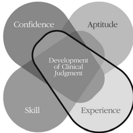
Figure 2. Lasater Interactive Model of Clinical Judgment Development (Permission to use from K. Lasater, EdD.)

Lasater’s Clinical Judgment Rubric (LCJR) (2005) was developed using the four main dimensions of Tanner’s Clinical Judgment Model (2006b) (Figure 1). The rubric represented the skill construct in Lasater’s Interactive Model of Clinical Judgment Development. Each component of Tanner’s Clinical Judgment Model was used as a dimension and subscale in the LCJR and described student actions during simulated patient care: noticing, interpreting, responding, and reflecting. The four subscales were divided into dimensions within each subscale for a total of 11 dimensions: