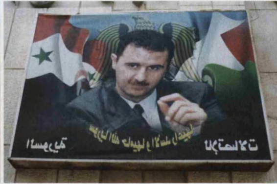
A. 'Yes for the beating heart of Arabism', Damascus 2009; B. 'Syria: God is her protector, Assad is her Shepherd', Damascus 2009