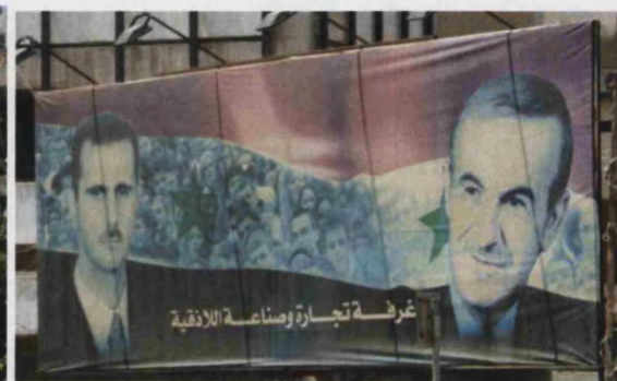
C. 'The eye doctor in the eyes,' Aleppo 2009; D. Guild of Trade and Industry of Lattakia, Lattakia 2009