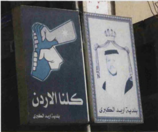
L. 'We are all Jordan; Municipality of Greater Irbid,' Irbid 2009