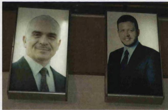
E. Pharmacy sign, Lattakia 2009; F. Amman airport, Amman 2009