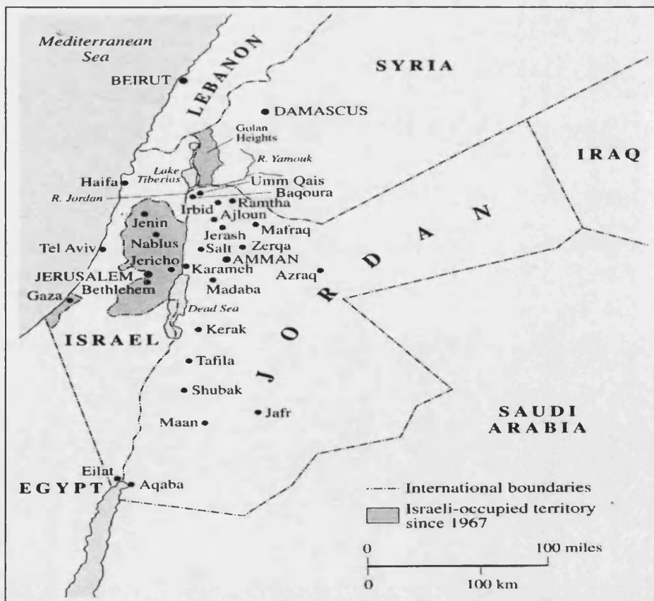
Map 2: Jordan and its neighbours