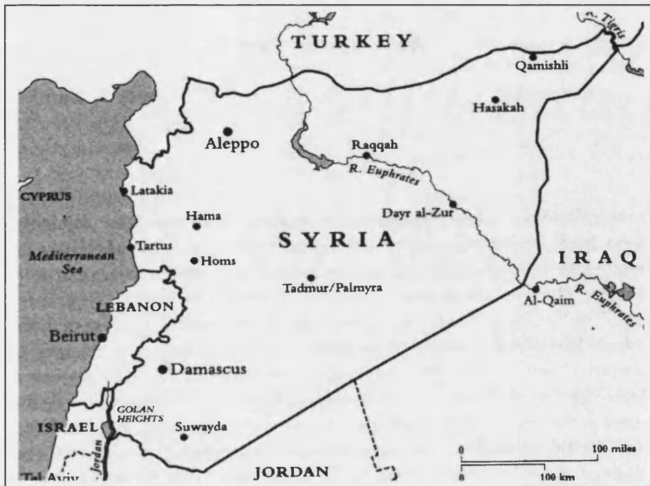
Map 1: Syria and its neighbours