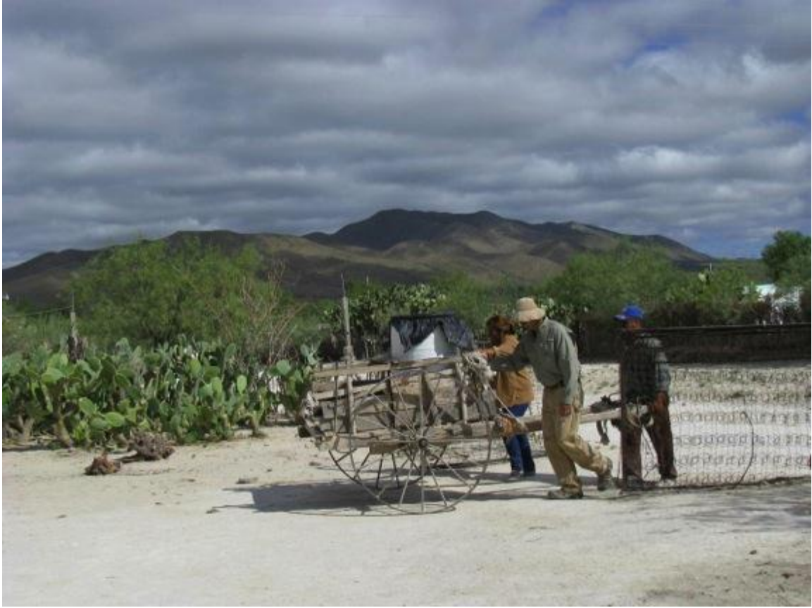
Figure 4. If a family does not have transportation to and from the agriculture pump, they can obtain water by hauling barrels back and forth in a cart.

With the usage of these pumps comes a different water-resource issue, that of high salinity. It is suspected that the aquifer they have tapped into has been drained significantly by the large-scale agriculture in the area, contributing to the salinity problem. An alternate theory is that the aquifer they can access is simply naturally salty. Whatever the reason, the water that people in El Gallo are drawing from their pumps is not potable, and is used primarily for hand-washing, cleaning (laundry and household), and watering crops and livestock. The residents of El Gallo currently rely principally on the import of purified water from an outside source to meet their cooking and drinking needs. Typically, a truck filled with garrafones (large plastic jugs capable of holding up to 19 liters) will pass through El Gallo once every eight days. These trucks come from