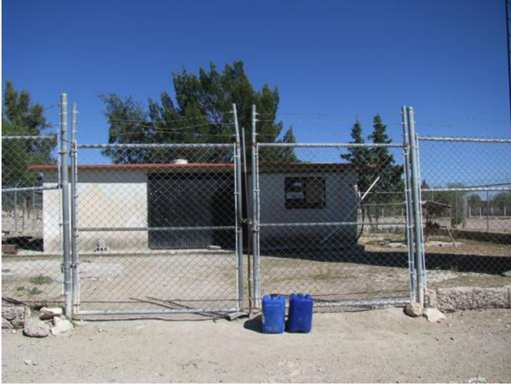
Figure 6. The treatment center for potable water in Ejido Hidalgo.