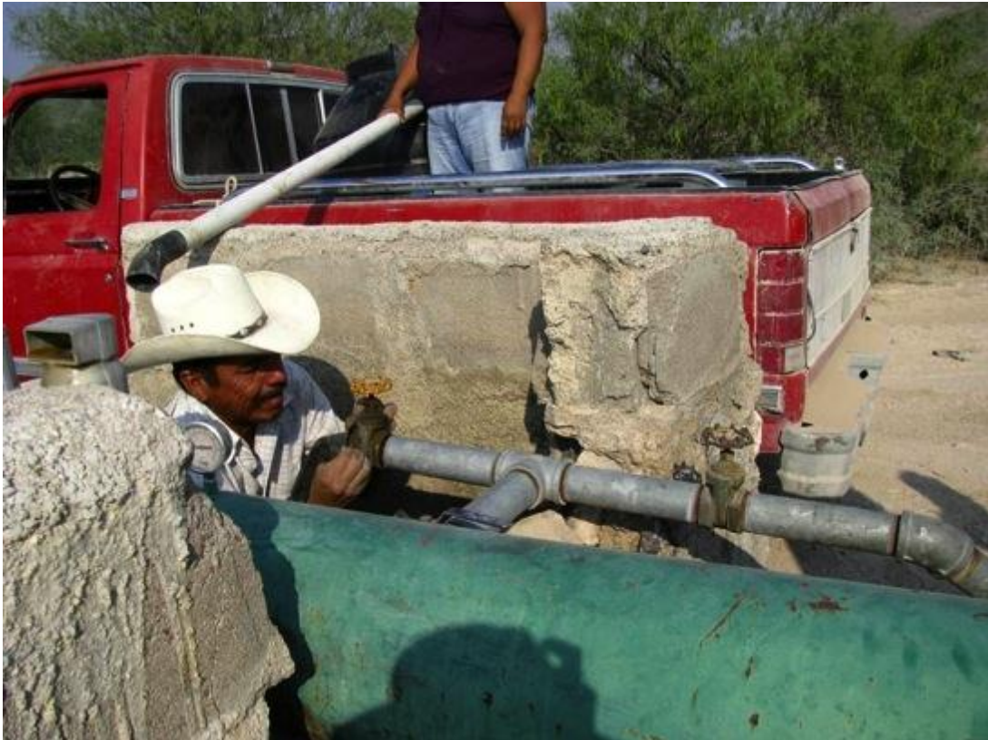
Figure 3. A resident of El Gallo collects water for use in his house from a pump located several kilometers from his residence.

Figure 3 is a photograph taken in El Gallo of a family collecting water from the irrigation pump located outside of El Gallo. Typically, families will bring as many containers as can be carried to the well, and fill each of them using a series of tubes connected to the pump and flowing into the containers. Fill times for each container depend on the size of the container and whether or not the pump is functioning properly.