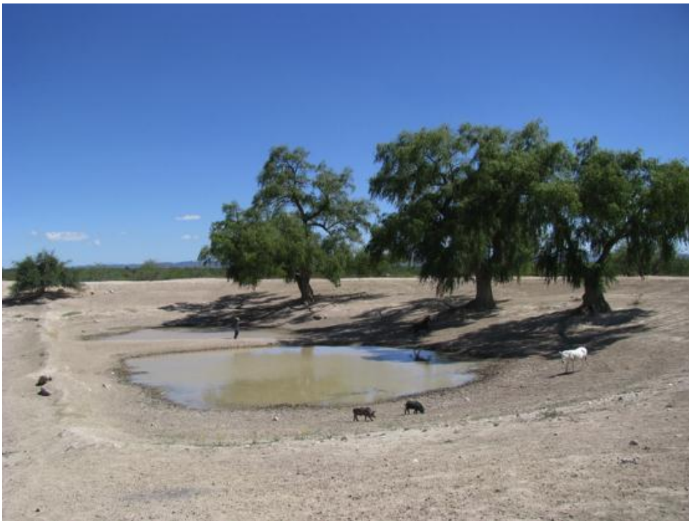
Figure 7. An aljibe in Ejido Hidalgo that can provide unimproved water.