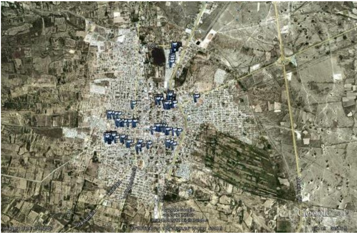
Figure 9. Distribution of surveyed sampling points in Matehuala. Information courtesy of INEGI ( www.inegi.org.mx ) and Google Earth ( www.googleearth.com ).

The majority of small rural communities of Matehuala also have access to piped water, though whether or not this water comes directly into their homes or they collect their household water from watering stations varies by community. Typically, there is a big measurer or macro medidor next to a valve at a point in the pipe that can be shut on or off by SAPSAM, depending on whether or not the community has paid their last water bill. This macro medidor keeps track of the total liters consumed by the community in a month, and it is up to the community members to self-report this quantity to SAPSAM officials, and to pay (collectively) what they owe. SAPSAM does not authorize its water to be used for agricultural purposes, though this can be difficult to enforce.