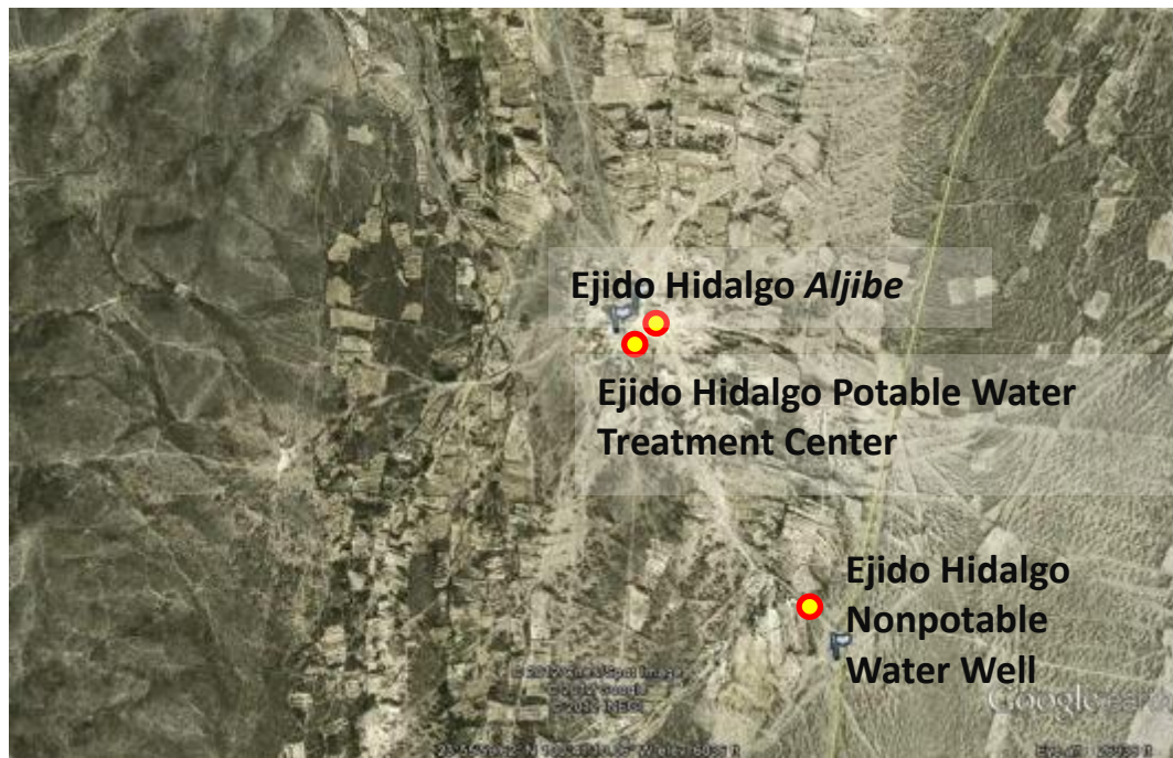
Figure 8. Locations of the pump supplying nonpotable piped water, the water treatment center, and the aljibe in Ejido Hidalgo. Information courtesy of INEGI ( www.inegi.org.mx ) and Google Earth ( www.googleearth.com ).