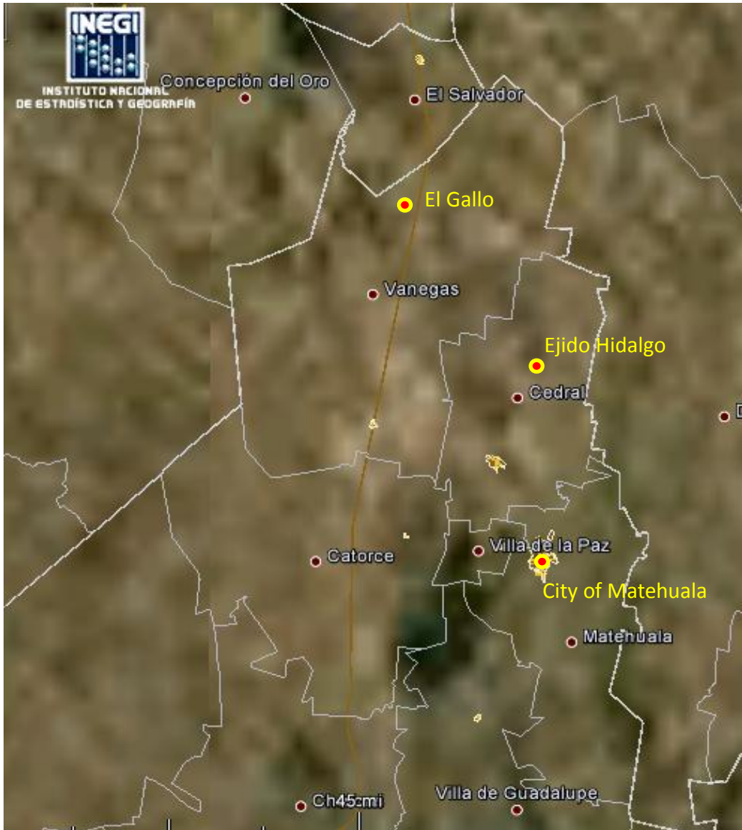
Figure 2. A map showing the three selected study sites and their geographical proximity to one another. Map generated courtesy of INEGI data ( www.inegi.org.mx ).