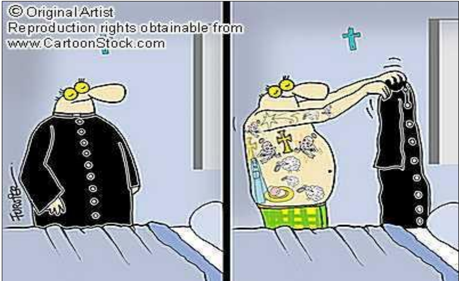
Figure 1. Priest Disrobing