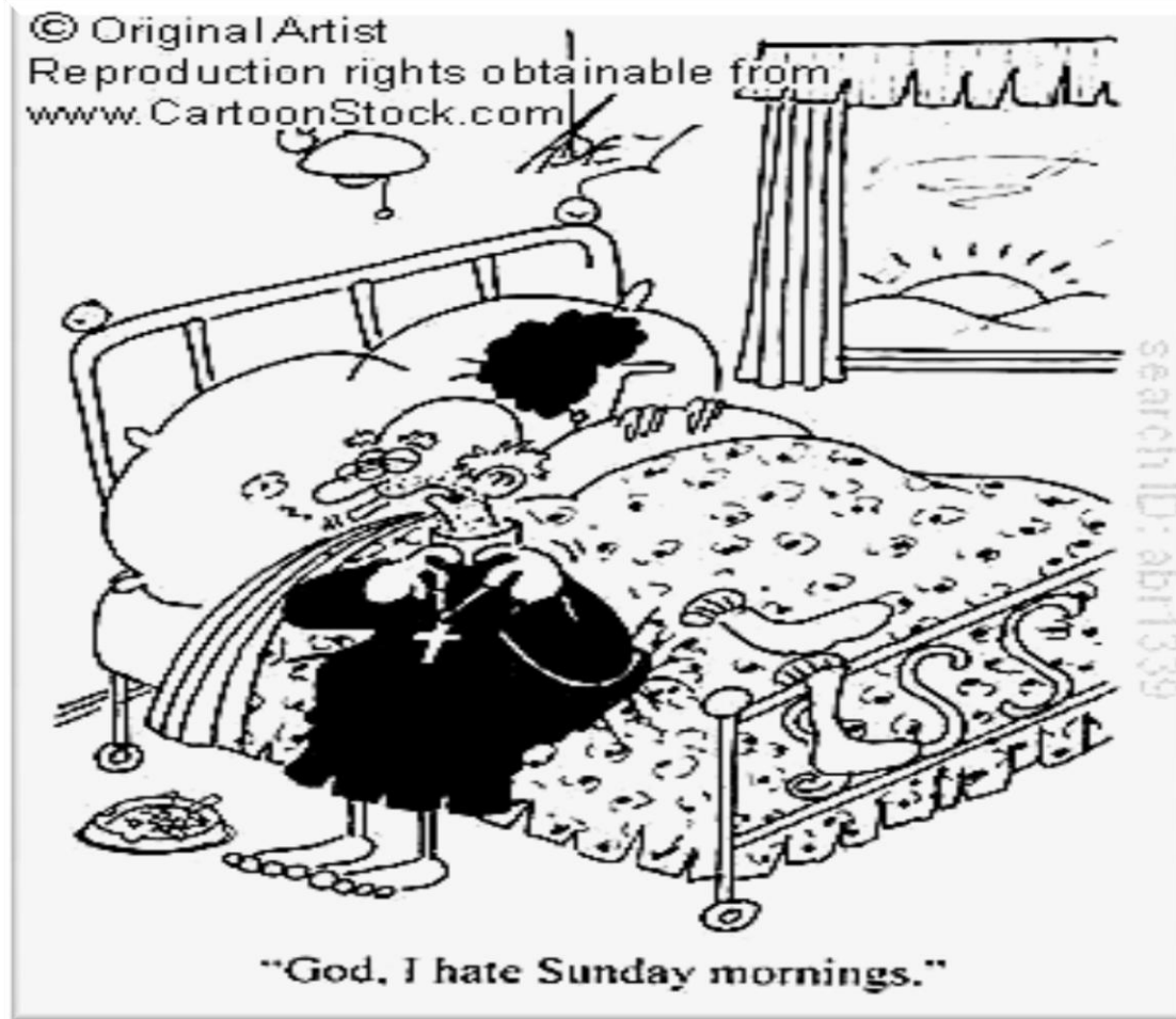
Figure 2. Sunday Mornings

One interviewed cleric who was accused and admits to being sexually abusive said