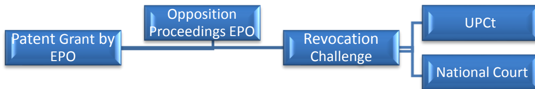
Fig. 4: Simplified representation of the interaction of opposition and revocation proceedings when the UPP comes into effect.

As a result of this, if an EP is successfully challenged by way of Opposition Proceedings after its grant by the EPO, the EPUE validated as a result will also be deemed not to exist. Thus, despite the fact that generally post-grant issues in relation to the EPUE are dealt with by the UPCt, Opposition Proceedings in the EPO continue to exist under the UPP. Therefore, at any one time a patent could be challenged on the grounds of the morality provisions through Opposition Proceedings in the EPO, and also revocation proceedings in the UPCt or national court. The UPCt, as examined below, must be informed of any pending opposition proceedings before the EPO and may decide to stay proceedings if a rapid decision may be expected from the EPO. 908 However, if it does not stay proceedings and upholds a patent subsequent to challenge, this patent may be subsequently revoked by the EPO. This gives rise to the potential for conflicting interpretations of these provisions.