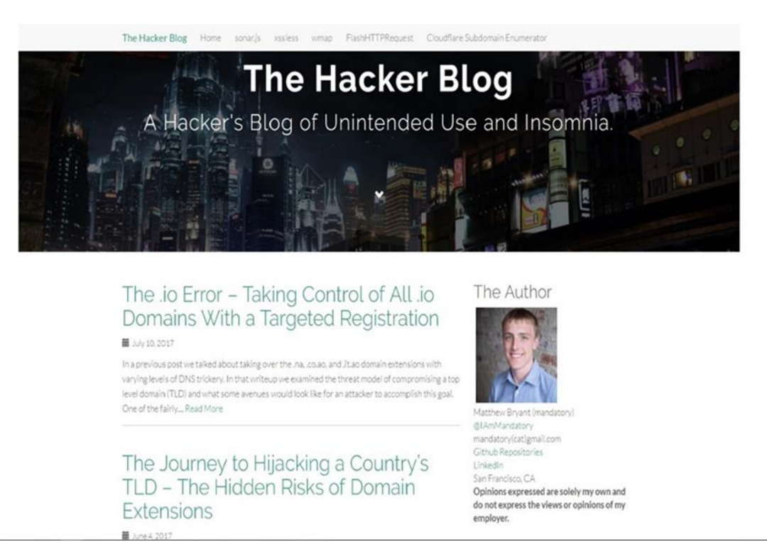
Figure 3. Static/Blog (thehackerblog.com)

interactions. In total, there were 18 blogs included in this study.