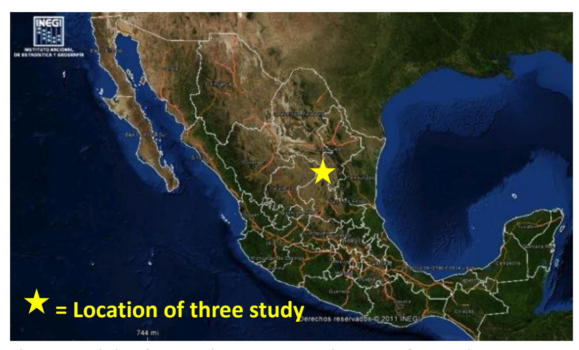
Figure 1. Study locations, Mexico.