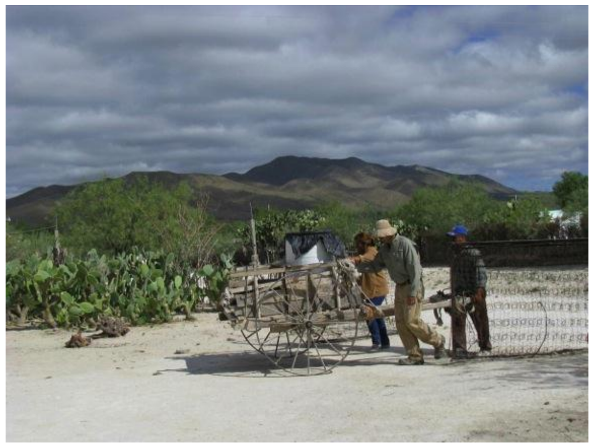
Figure 4. If a family does not have transportation to and from the agriculture pump, they can obtain water by hauling barrels back and forth in a cart.

With the usage of these pumps comes a different water-resource issue, that of high salinity. It is suspected that the aquifer they have tapped into has been drained significantly by the large-scale agriculture in the area, contributing to the salinity problem. An alternate theory is that the aquifer they can access is simply naturally salty. Whatever the reason, the water that people in El Gallo are drawing from their pumps is not potable, and is used primarily for hand-washing, cleaning (laundry and household), and watering crops and livestock. The residents of El Gallo currently rely principally on the import of purified water from an outside source to meet their cooking and drinking needs. Typically, a truck filled with garrafónes (large plastic jugs capable of holding up to 19 liters) will pass through El Gallo once every eight days. These trucks come from