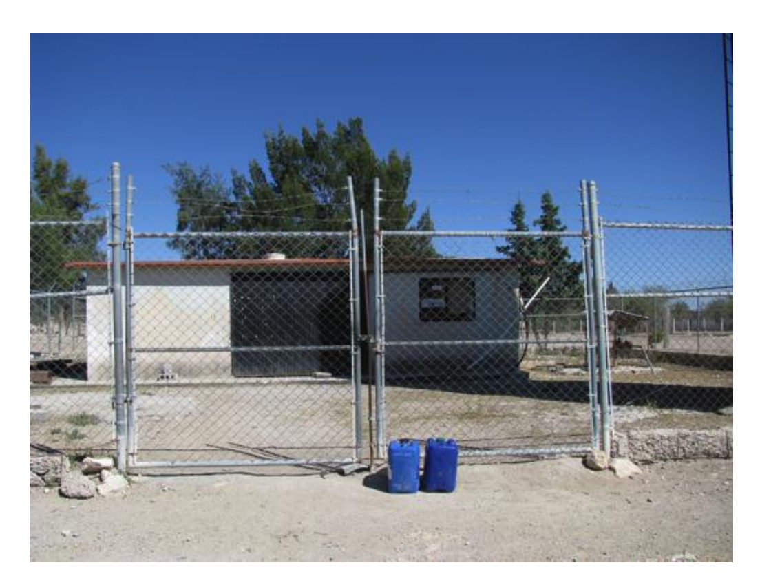
Figure 6. The treatment center for potable water in Ejido Hidalgo.