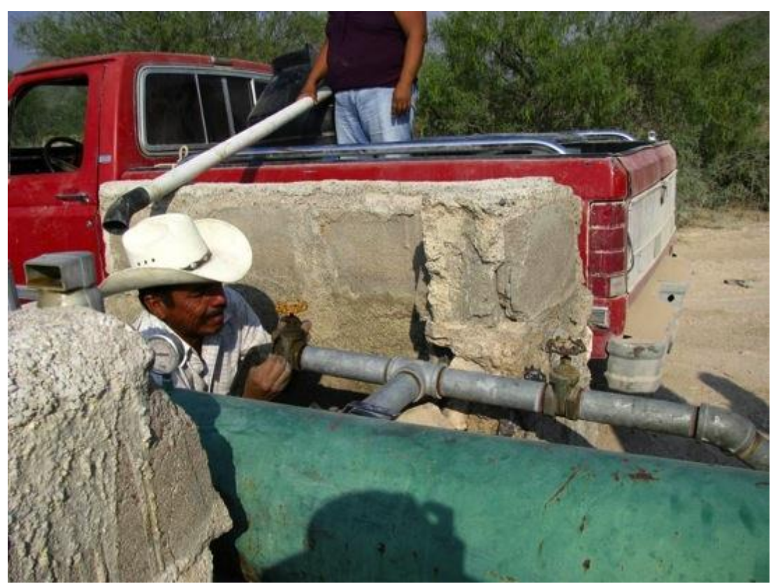
Figure 3. A resident of El Gallo collects water for use in his house from a pump located several kilometers from his residence.

Figure 3 is a photograph taken in El Gallo of a family collecting water from the irrigation pump located outside of El Gallo. Typically, families will bring as many containers as can be carried to the well, and fill each of them using a series of tubes connected to the pump and flowing into the containers. Fill times for each container depend on the size of the container and whether or not the pump is functioning properly.