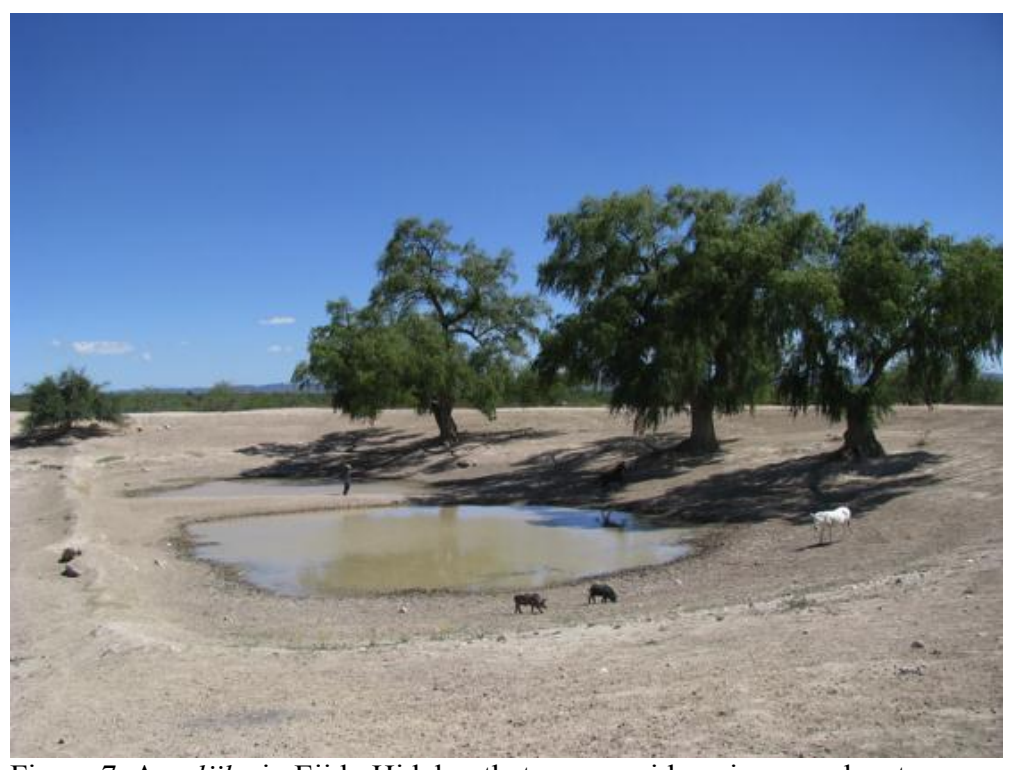
Figure 7. An aljibe in Ejido Hidalgo that can provide unimproved water.