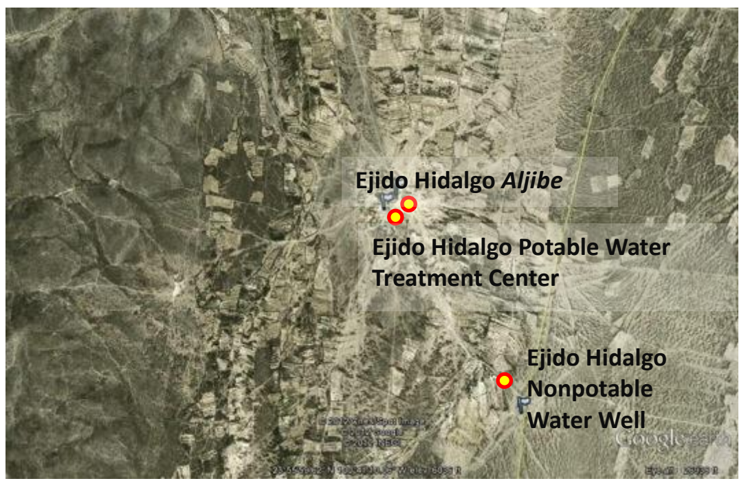
Figure 8. Locations of the pump supplying nonpotable piped water, the water treatment center, and the aljibe in Ejido Hidalgo. Information courtesy of INEGI (<a href="www.inegi.org.mx">www.inegi.org.mx</a>) and Google Earth (<a href="www.googleearth.com">www.googleearth.com</a>).