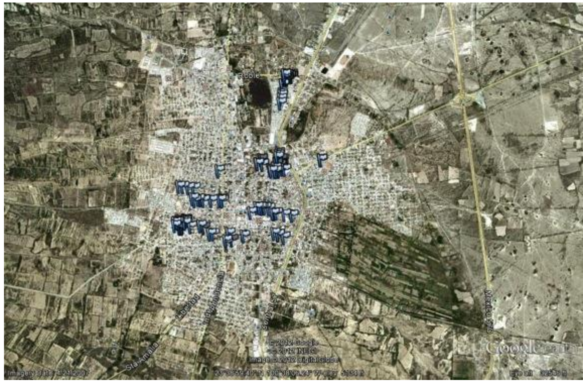
Figure 9. Distribution of surveyed sampling points in Matehuala.

The majority of small rural communities of Matehuala also have access to piped water, though whether or not this water comes directly into their homes or they collect their household water from watering stations varies by community. Typically, there is a big measurer or macro medidor next to a valve at a point in the pipe that can be shut on or off by SAPSAM, depending on whether or not the community has paid their last water bill. This macro medidor keeps track of the total liters consumed by the community in a month, and it is up to the community members to self-report this quantity to SAPSAM officials, and to pay (collectively) what they owe. SAPSAM does not authorize its water to be used for agricultural purposes, though this can be difficult to enforce.