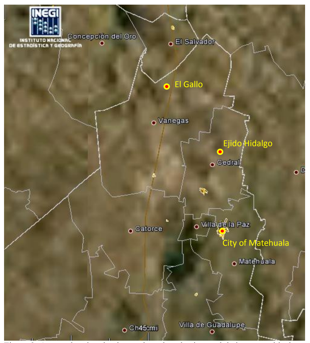
Figure 2. A map showing the three selected study sites and their geographical proximity to one another. Map generated courtesy of INEGI data (www.inegi.org.mx).