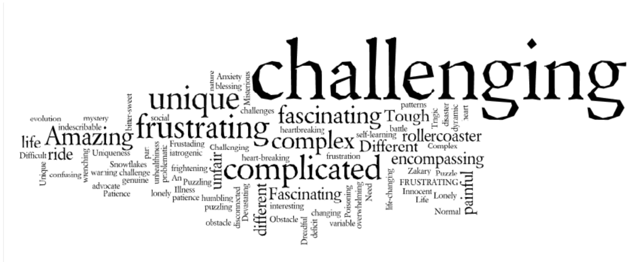
Parents’ Responses When Asked to Describe ASD in One Word

*Note. Larger fonts indicate more frequently occurring words