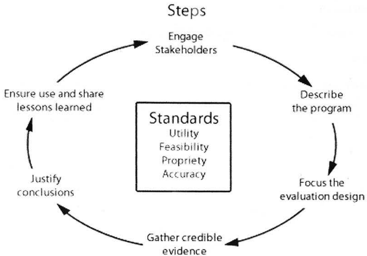
Figure 1: The CDC Framework for Program Evaluation

The CDC Framework consists of six steps and four standards that are used to evaluate the quality, value, and importance of a program and to bring to light areas for program improvement. The first step engages the stakeholders, or those who have an investment in what will be discovered in the evaluation and those involved in program operations. The values and concerns of those involved in the program should be understood. The next step describes the program in detail, including its history and importance, its activities, expected effects, resources, and its context in the health care environment. The program goals are defined and agreed upon by the stakeholders. The third step focuses the evaluation design to include the issues of concern to the stakeholders, with a view towards utility and efficiency of resources. Factors to consider