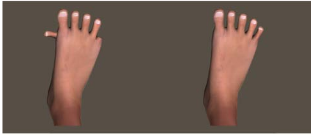
Figure 3. Examples of a reorganized foot (E) and intact foot (F).