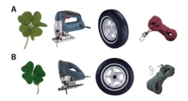
Figure 1 . Example similar stimulus pairs. Initial stimuli (A) were followed after a variable lag by either an exact repeat or a lure stimulus (B), which were visually and conceptually similar to the first image. Participants were instructed to respond "new" to novel stimuli, "old" to exact repeats, and "similar" to lure stimuli.