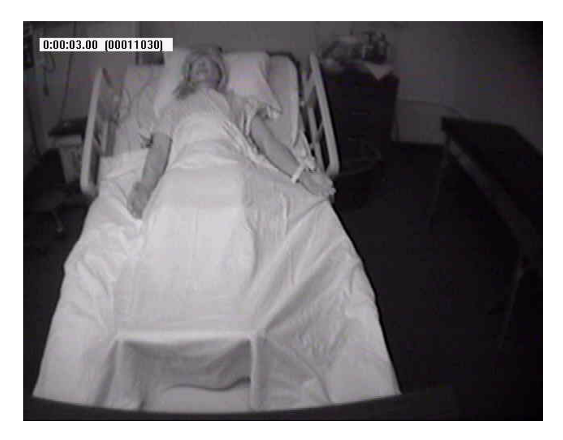
Figure 1: A patient model lying in the Emergency Department during HPS