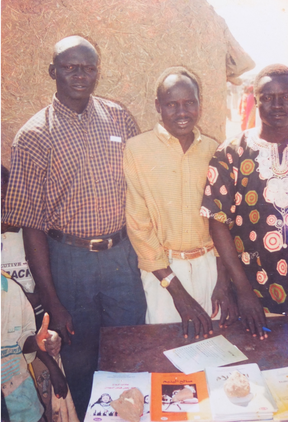
Figure 6: Street sales of locally-produced Dinka and Arabic-language pamphlets Haj Yousif, c. early 2000s.