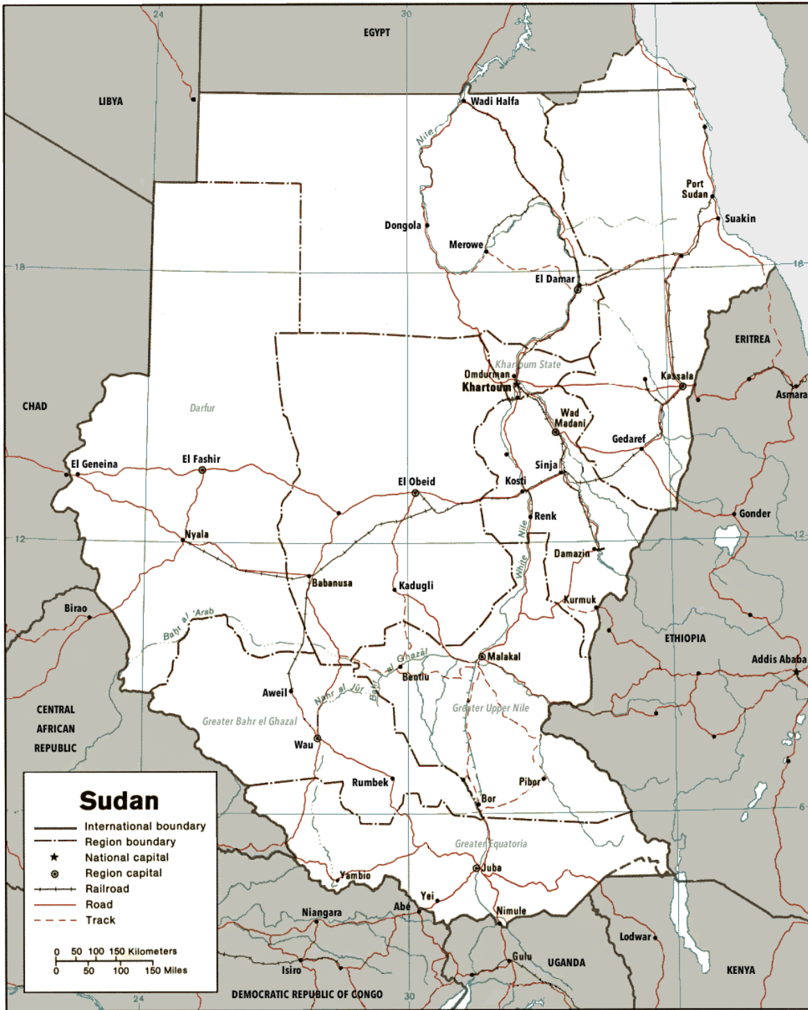
Figure 1: Map of pre-separation Sudan