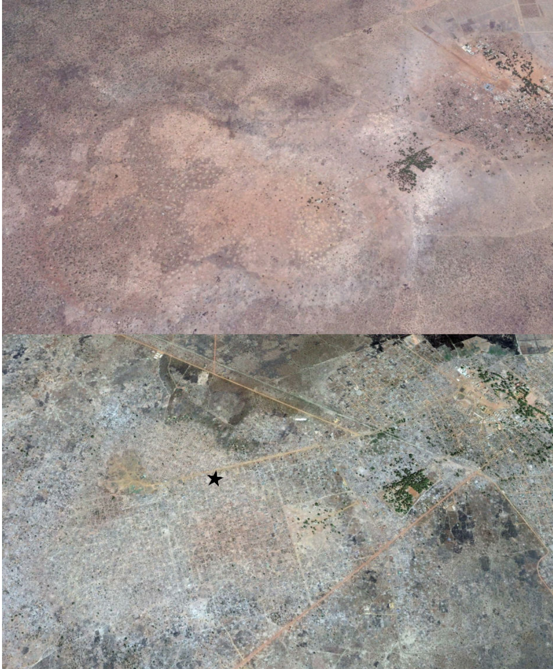
Figure 2: Satellite images of Aweil town Aweil town in 2003 (above) and 2015 (below), showing part of the massive suburban growth of the town. My rented room is marked by the black star.