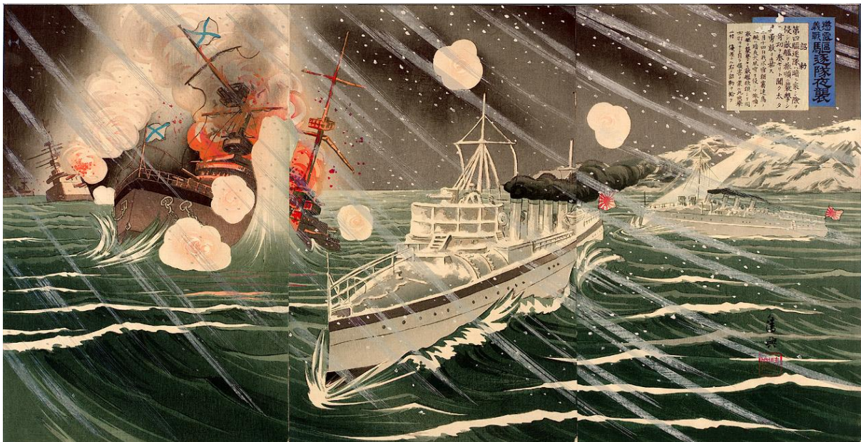
IMAGE SEVEN: Shinohara Kiyooki, A Righteous War to Chastise the Russians: The Night Attack of the Destroyer Force (December, 1904).

URL: < http://ocw.mit.edu/ans7870/21f/21f.027/throwing_off_asia_03/toa_essay02.html > (accessed 6 January 2015).