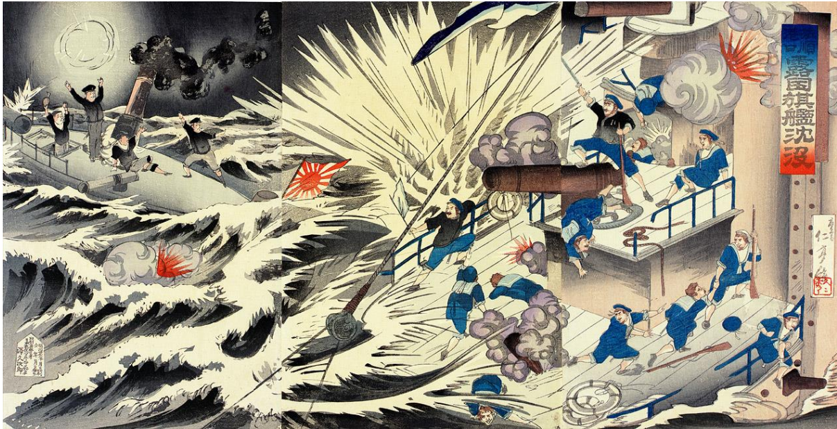
IMAGE SIX: Nitei, Harbour Entrance of Port Arthur: Russian Flagship Sinking at Port Arthur (1904).