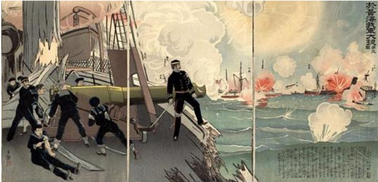
IMAGE ONE: Kobayashi Kiyochika, Our Forces' Great Victory in the Battle of the Yellow Sea – Third Illustration: The Desperate Fight of the Two Warships Akagi and Hiei (October 1894).