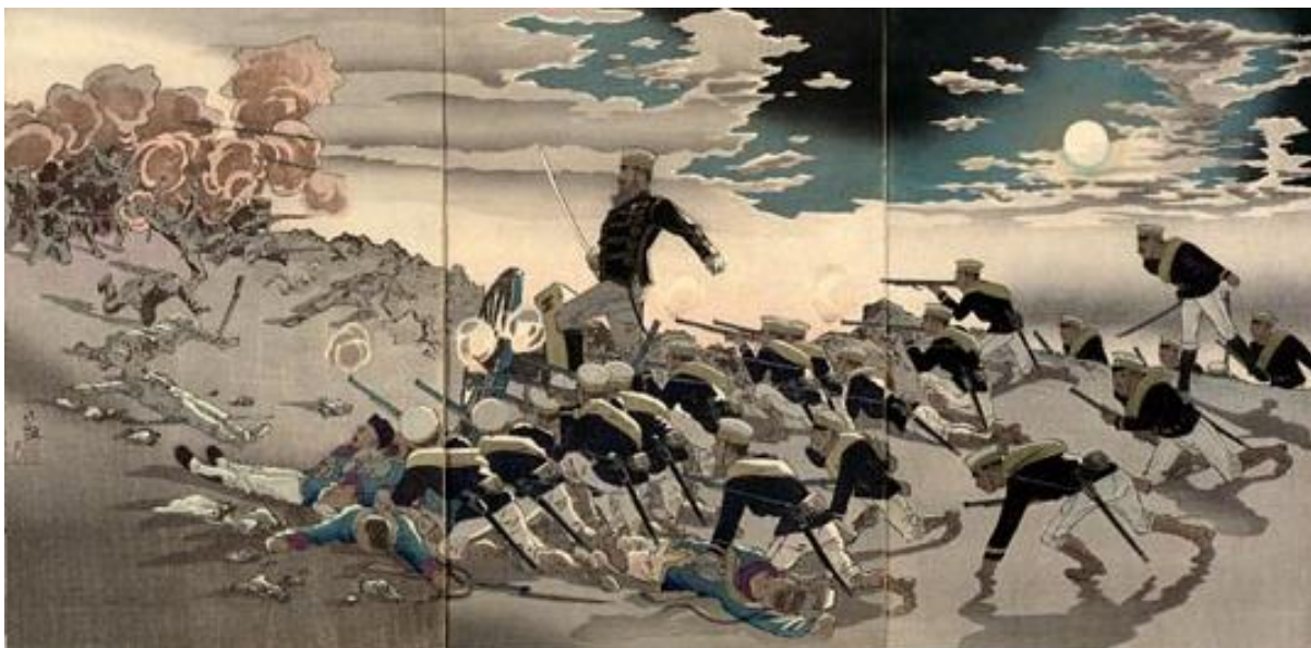
IMAGE TWO: Kobayashi Kiyochika, Picture of our Armed Forces Winning a Great Victory After a Fierce Battle at Pyongyang (October, 1895).

URL: < http://ocw.mit.edu/ans7870/21f/21f.027/throwing_off_asia_02/toa_essay02.html > (accessed 6 January 2015).