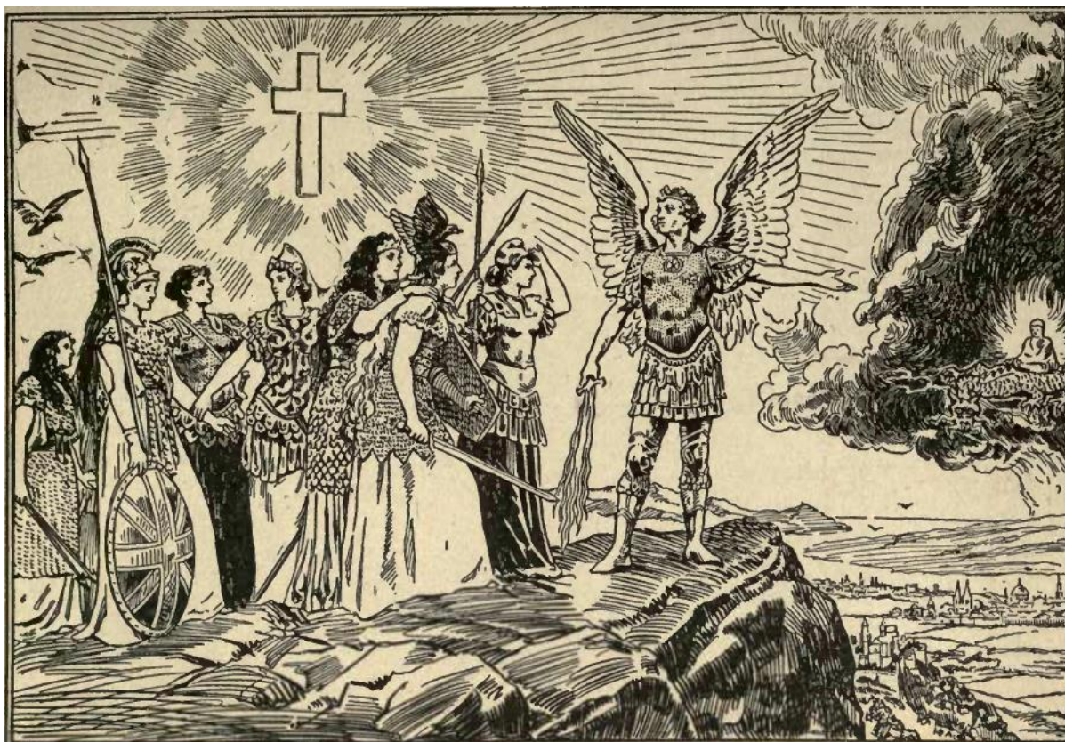
IMAGE THREE: Kaiser Wilhelm II's painting, The Yellow Peril (1895).

This painting and the coining of the phrase "yellow peril" was inspired by Kaiser Wilhelm II following a dream he had. The German inscription of the painting reads "Völker Europas, wahrt eure heiligsten Güter" translated to mean "Peoples of Europe, guard your dearest goods".