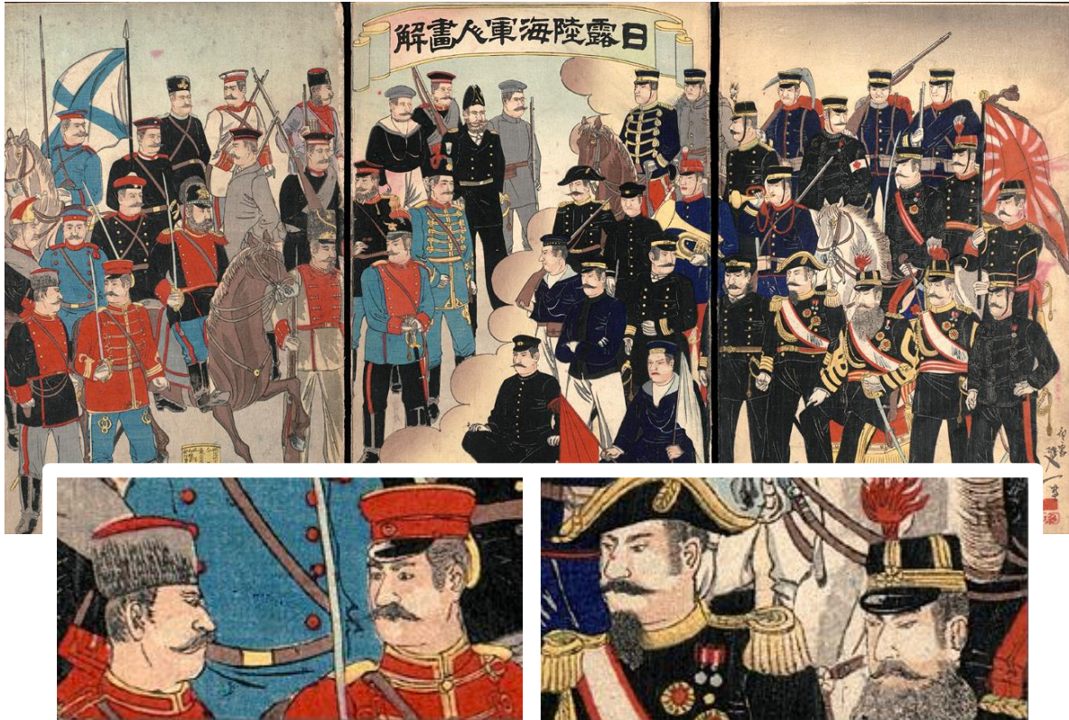
IMAGE FIVE: Watanabe Nobukazu, Illustration of Russian and Japanese Army and Navy Officers (February 1904).