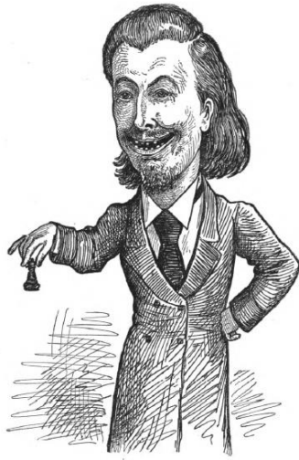
"A LITTLE BIT OF MORPHY."

In contrast to Steinitz, writers put Blackburne forward as the respectable face of professionalism. The cartoon of Blackburne in the pages of the WP , just a month after its