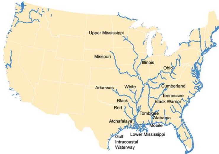
Figure 2 – The inland waterways studied include the Arkansas, Illinois, and Ohio waterways (“Navigable Inland Waterways,” 2009).

The datasets were made up of 28 variables (See Appendix). Of those, we included 12 in our initial regression analysis. After considering vessels, flotillas, and lockages are physically related, we chose to include the variables related to vessels and disregard the variables concerning flotillas and lockages as vessels make up a fleet and more than one fleet (flotillas) make up a lockage.