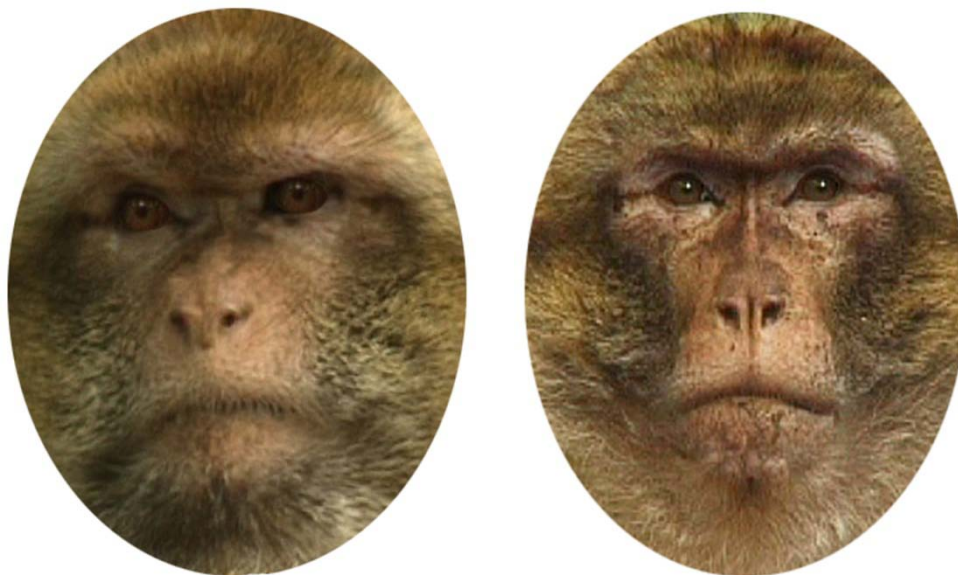
Figure 1: Example of Barbary macaque face pairing stimuli used in each experiment.