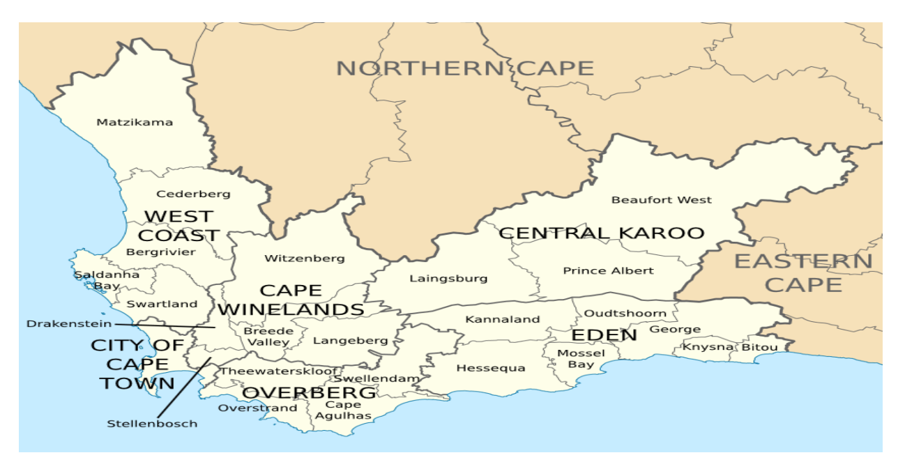
Fig. 2 District municipalities in the Western Cape Province<sup>702</sup>

The Western Cape Province is situated in the south-western part of the country. It is the fourth largest of the nine provinces in both area and population, with an area of 129,449 square kilometers and a population of 5.8 million. He Western Cape Province resembles an L-shaped which extends north and east from the Cape of Good Hope. The far interior of the Western Cape Province forms part of the dry Karoo and the south coast boasts the lush and evergreen vegetation extending to Table Mountain. The Cape of Good Hope is most popularly known in Western