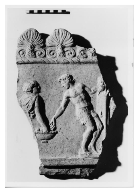
Fig. 1.1 Terra cotta relief showing a man bathing a herm.<sup>211</sup>

such close physical contact with its devotees.<sup>209</sup> This is possibly in contrast to what may have been more regular washing and cleaning that perhaps rose out of necessity and for which we have far less detailed evidence, but which may have been recognisable to many as a common requirement of cult statues (see fig. 1.1).<sup>210</sup>