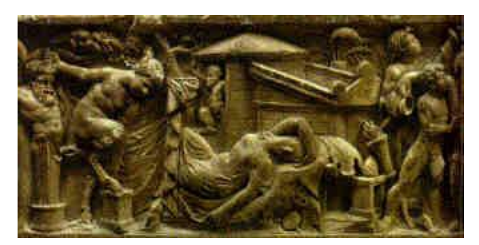
Fig. 4.4: Sarcophagus, now in the National Museum at Naples.<sup>671</sup>

This poem is not the only one in the collection that refers explicitly to individuals attempting sexual intercourse with statue/god; indeed the trope appears to have been relatively common.<sup>670</sup> The only visual representation in antiquity of sexual intercourse occurring between a statue and a living being is found on a sarcophagus, which depicts a Priapus-style ithyphallic image, although the perpetrator is a mythical figure: a Pan (with apparently female attributes?), which lowers itself onto the phallus backwards (see fig. 4.4).