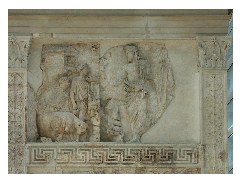
Fig. 6.1: relief of Aeneas sacrificing to the Penates on the Ara Pacis, the temple in the distance in the top left appears to include representations of the gods.<sup>823</sup>

This distance can also be seen on the most realistic coin types depicting an image within a temple (whether it is a sacrificial scene or not). These coins attempt to create the illusion of perspective, sometimes including a line at which the statue's base meets the ground, and in such instances the image is almost invisibly small, due to its proper location at the back of the cella .<sup>824</sup> These representations demonstrate a significant part of the problem in assuming the visibility of the cult image during sacrificial rituals, in that the image would often be at quite some distance from the sacrifice, masked by columns, and at the very back of a crowded, and possibly poorly lit, room; all this behind the people, animals, and smoke associated with public sacrificial rites.