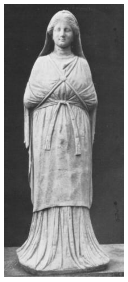
Fig. 3.3: Artemis Kindyas from Bargylia in Caria, which like many other representations of the image suggests that the fetters were incorporated into the sculpture, rather than imposed upon it.<sup>565</sup>

Examples from the Roman world attest to the clipping of wings, restraint with chains, or binding of some kind on a large variety of different images: it is not a practice associated with one particular god or cult. Some also have a particular narrative of movement attached to them, which directly involve interaction between mortals and the divine. Plutarch relates one well known example, in his Life of Alexander , that whilst the Macedonians besieged their city in 322/1 BCE, the Tyrians bound the statue of Apollo in the ancient temple of Heracles/Malqart in order to prevent it from going over to the enemy. After his victory, Alexander removed the chains from the image, and renamed it Apollo Philalexandros.<sup>566</sup> This is a fascinating example: the chains on the image clearly did not work in having an impact upon the deity, but the image is thanked for the deity's apparent actions.<sup>567</sup> Evidently, one