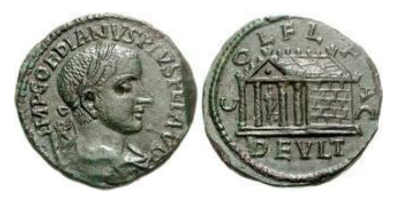
Fig. 3.1: Thracian coin of Gordian, 238-244 CE, depicting a

It will already be apparent that the role of cult images was not theoretically or ideologically static; that in conceptual terms the cult statue was an artefact and symbol of great fluidity and movement. However, in practical terms, these images are often perceived as inherently static items, defined by their geographical locations in sanctuaries and temples. This is obvious from the very titles of scholarly works that discuss cult statues, such as Martin's Römische Tempelkultbilder: eine archäologische Untersuchung zur späten Republik , in which he recognises that his definition is restrictive, but nevertheless relies explicitly upon the temple setting for the allocation of the prefix 'cult' to an image.<sup>466</sup> In addition, certain types of evidence rely rather heavily upon the geographical location is so used for identifying purposes.<sup>467</sup> However, even this depiction of a cult image and is so used for identifying purposes.<sup>467</sup> However, even this depiction of a cult image's location as within a temple is perhaps misleading: images on coins do not normally show the statue in that part of the temple in which it would stand, but brought forward so as to fit within the media in which it is produced (see fig. 3.1).<sup>468</sup>