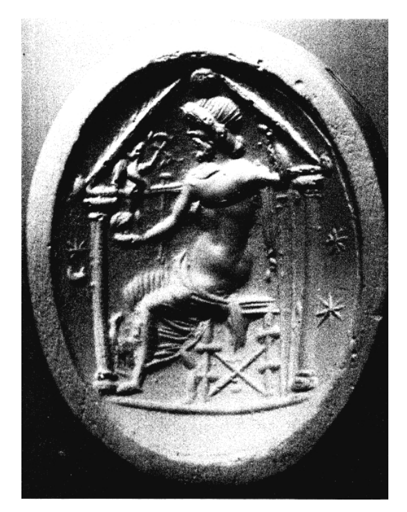
Fig. Intr.2 Engraved ring stone depicting the chryselephantine Zeus at Olympia. The size of the statue is indicated by the manner in which the god fills the temple.<sup>13</sup>

prevent it from being a cult statue, for many such images were the recipients of cult at the highest and most public levels (see figs. Intr.3-4).<sup>11</sup> A great deal of scholarly time, particularly within the disciplines of Art History and Anthropology, has been devoted to demonstrating that images that are aniconic can still represent a god, primarily through the human association of that artefact (stone/plank of wood/tree, and so on) with that deity. The unwrought stone, for example, looks as much like a divinity as an anthropomorphic representation does, for it is what that god looks like to that devotee at that time.<sup>12</sup>