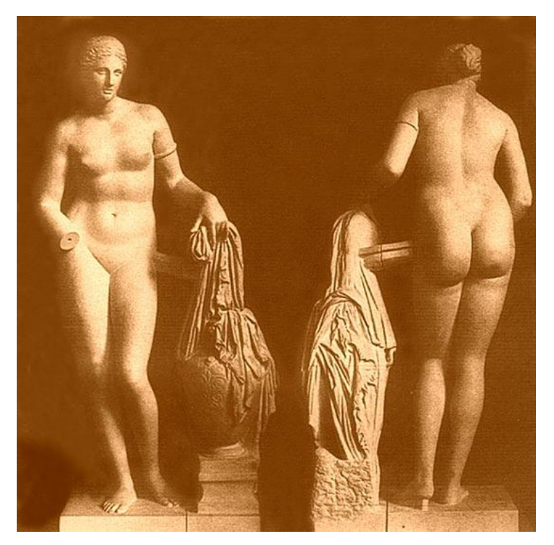
Fig. 4.3: Roman copy of the Aphrodite of Knidos, which was famously visible from all angles, adding to her apparent sexual appeal.

The tales of Pygmalion and the Roman knight complement each other: one describes a lover who treats his ivory maiden much as one might treat a cult statue or living woman, the other describes a lover who treats a cult statue as one might treat a cult statue or living woman. Both authors manipulate the possible interactions that an individual could have with a living individual, divinity or inanimate statue to ensure that the image occupies an impossible and indefinite position.<sup>663</sup> Although the device here is a literary technique, it is also quite telling about the range of interactions and attitudes that were possible with regards to cult images.<sup>664</sup> A further factor that the tales have in common is that the conclusion is as extreme as the intentions towards the image: Pygmalion's ivory maiden comes to life at the bidding of Venus and is married to him; the Roman knight succeeds in obtaining the image of Aphrodite for one night, but a permanent stain of his crime is left on the image and he commits suicide.<sup>665</sup>