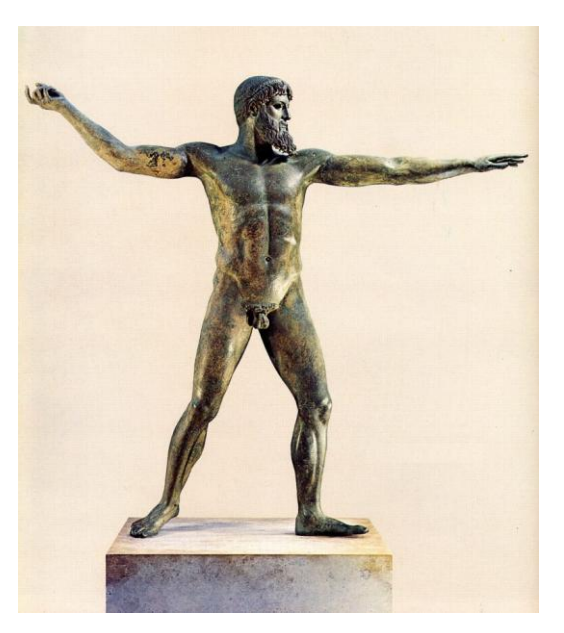
Fig. Intr.1: The Artemision Bronze, Zeus or Poseidon (?), bronze, ca. 460 BCE.<sup>8</sup>

Clearly, the remains of images that we have cannot normally be allocated the title of cult statue through their appearance alone, for as the Oration makes clear, one cannot tell simply by looking. This is a problem further enhanced by the multiple modes in which a god might be represented in its cult image: gods not only had multiple forms and appearances (sometimes suggesting a particular cultic aspect, sometimes not), but they could also be wrought in a variety of styles. These styles do not necessarily indicate anything of the importance of the image or the god: the chryselephantine Zeus at Olympia (fig. Intr.2), for example, certainly could be categorised as a cult statue, but so could, in fact, some trees!<sup>9</sup> We know that many of the most ancient and sacred cult images were not entirely (or necessarily at all) anthropomorphic.<sup>10</sup> The worship of an aniconic representation of a divinity does not