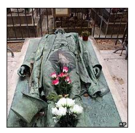
Fig. 4.1 The effigy of Victor Noir in Paris, which is now guarded by railings and a sign reading "Any damage caused by graffiti or indecent rubbing will be prosecuted." The effect of rubbing on the image is clearly visible.<sup>633</sup>

the material are visibly worn away (fig. 4.1).<sup>631</sup> Indeed, human contact has had so much physical impact upon these images that the touching of them is now either regulated or forbidden altogether.<sup>632</sup>