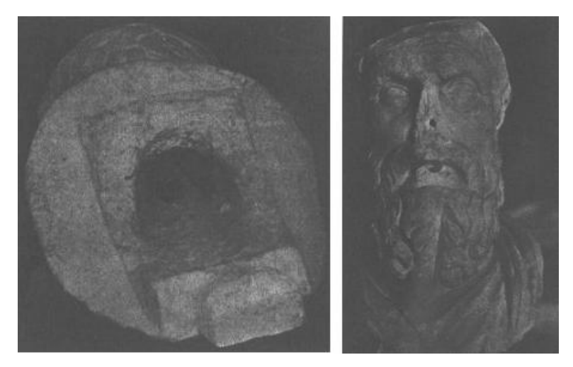
Fig. 2.2a : The base of the Epicurus head, showing the chiselled out hollow; Fig. 2.2b: The front of the Epicurus head.<sup>367</sup>

out within it from the base of the neck through to the mouth. On discovering this, those enlisted to restore the image experimented with pipes connected to the channel, and it apparently produces clear and rather mystical sounding words if they are spoken into the pipe from a distance.<sup>364</sup> It seems that two Roman temples in Karamis (Fayum, Egypt) had images placed against hollowed out sections of the walls, and a similar temple in Corinth were designed for essentially the same purpose of having a human delivering oracles through them.<sup>365</sup> These fit well with the late accounts of Theodoret, Kyrillos and Rufinus on the hollowing out of walls and the existence of special chambers behind them through which priests could make the image appear to speak.<sup>366</sup>