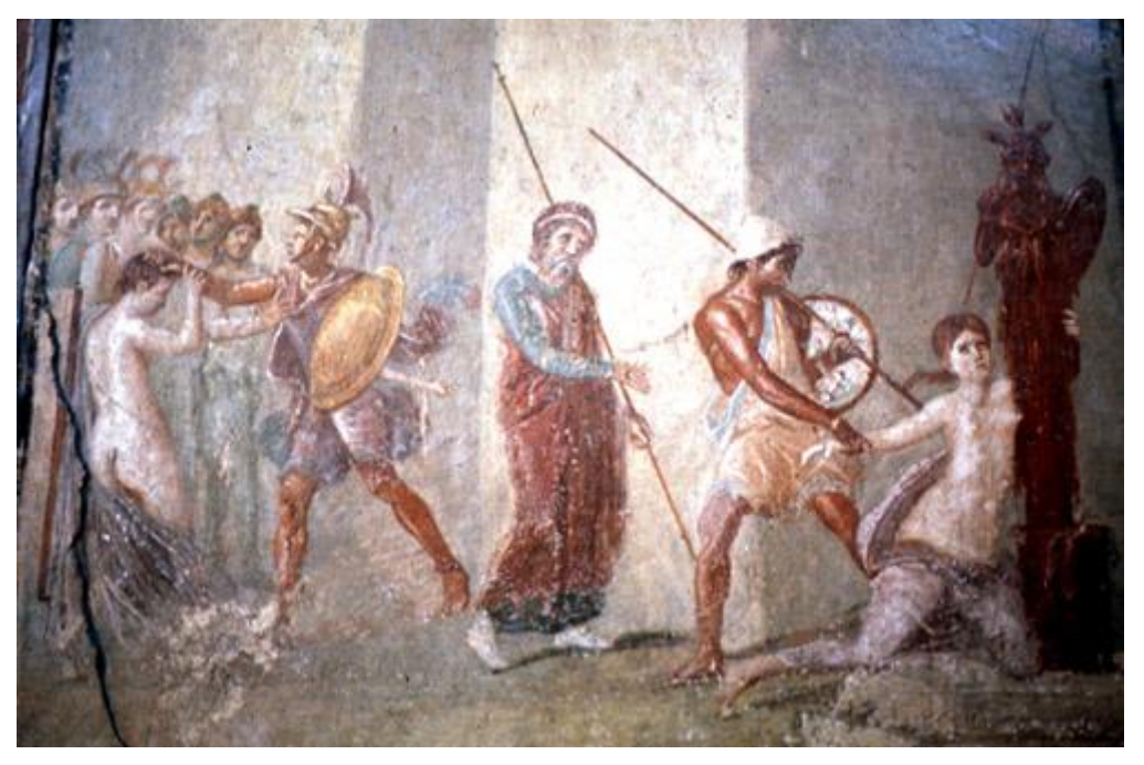
Fig. 4.2: Pompeiian wall painting depicting the dragging of Cassandra from the statue of Athena at Troy, probably the most famous instance of embracing a statue for sanctuary in the ancient world.<sup>636</sup>

suppliant is clearly expecting the image or god to have some active response to the act of touch, even if it is simply to impress enough piety upon the assailant that the suppliant will be safe. This practice of turning to statues as sanctuary is most commonly found either as a last resort or as the specific domain of slaves (who realistically had few other lines of defence). It is also a very ancient practice, and is attested throughout antiquity, from Classical Greece to the Late Empire (see fig. 4.2).<sup>635</sup> Apparently the protective power of cult images was significant, and yet it was not to be called on for just any occasion; most instances relate to life-threatening attacks. The implications for our understanding of the role held by images have already been mentioned, and include the importance of assessing extreme forms of interaction, as well as adding a new dimension to our knowledge of the range of powers and properties that a divine image might be perceived to have had.