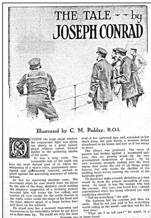
First page of Conrad’s “The Tale” in the Strand Magazine issue for October 1917.

Conrad, who had to support a family through his income as a writer, would certainly not have refused writing a story appropriate for publication in as lucrative and well-paying a magazine as the Strand . While it is difficult to determine how much exactly Conrad received for “The Tale”, documented payments made to other contributors can give an idea of the sums involved. In 1908, Winston Churchill received £150 per contribution for a series of nine articles. At the same time, Kipling was paid £90 and W.W. Jacobs £110 per short story, which was later raised to £350 as Jacobs’s popularity increased. 80