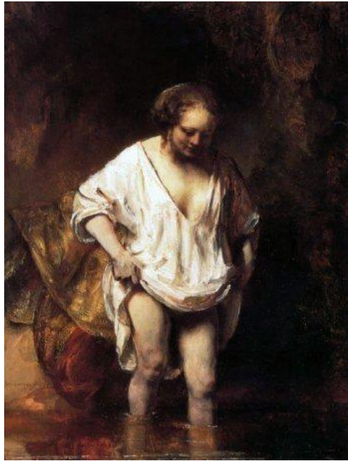
Rembrandt van Rijn. A Woman Bathing in a Stream (Hendrickje Stoffels?) . 36