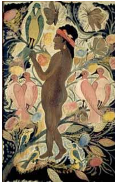
Hector Hyppolite. Maitresse Erzulie . 27

are made visible as a point of interaction with the external world.