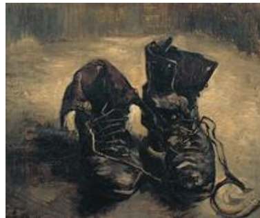
A Pair of Shoes (1886)

attitude is reflected in this essay, too: in his idea of serviceability (which molds both matter and form), the shoes and the peasant woman at one with each other in the field, and the “oneness” standing forth from the canvas and appealing to the viewing subject.