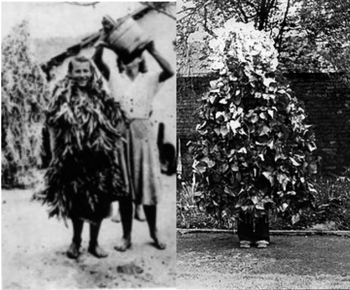
Left, Dodola, Western Serbia 1957. Right, Jack of the Green, Kensington 1976 224