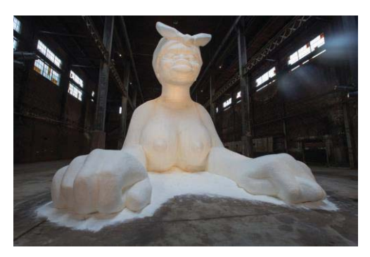
Figure 1: The Sugar Baby