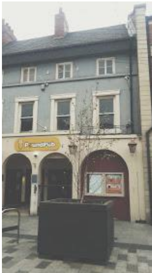
Figure 5. Pound Pub on Stockton high street

2016). Opinions about who it was redeveloped for were ambivalent and mixed. There was a general feeling, however, that many in Stockton were doing badly under austerity, and this costly regeneration by the council sat uneasily with them, at a time of so many cuts.