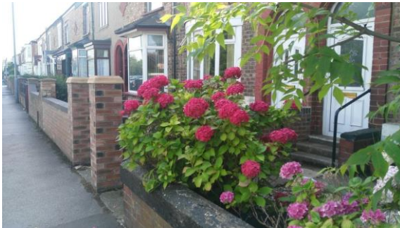
Figure 8. Flowers blooming in a front garden in the town centre

To learn hope is to see the force in the present of a world that does not yet exist but could do: the strength here and now of that which does not fit, of that which screams, however silently, 'No, we do not accept, we shall create another world.'