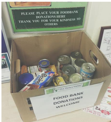
Figure 6. Foodbank collection at Thrive

The 'Big Society' rhetoric has pinpointed middle-class voluntarism as the utopian ideal at the heart of Coalition's project of localism. Certain homogenising ideas of community have been played up, which has been intensified under austerity. This is particularly problematic in the disadvantaged areas affected by state retrenchment (Featherstone et al., 2011) where charities such as foodbanks step in where the state has retreated. Dowling and Harvie (2014) have pinpointed two of the main aspects of the Big Society rhetoric as the retreat of the state in service provision, the expectation that volunteers will plug any gaps in services, alongside the devaluing of the role of social reproduction, 'placing the associated costs onto the unpaid realms of the home and the community' (2014: 870). It simultaneously allowed tasks associated with social reproduction to be 'harnessed for profit – thus providing a potential source of new capitalist accumulation, enabling an increasing 'financialisation of daily life' (Martin, 2002) and a deepening of capitalist disciplinary logic (Dowling and Harvie, 2014: 870).