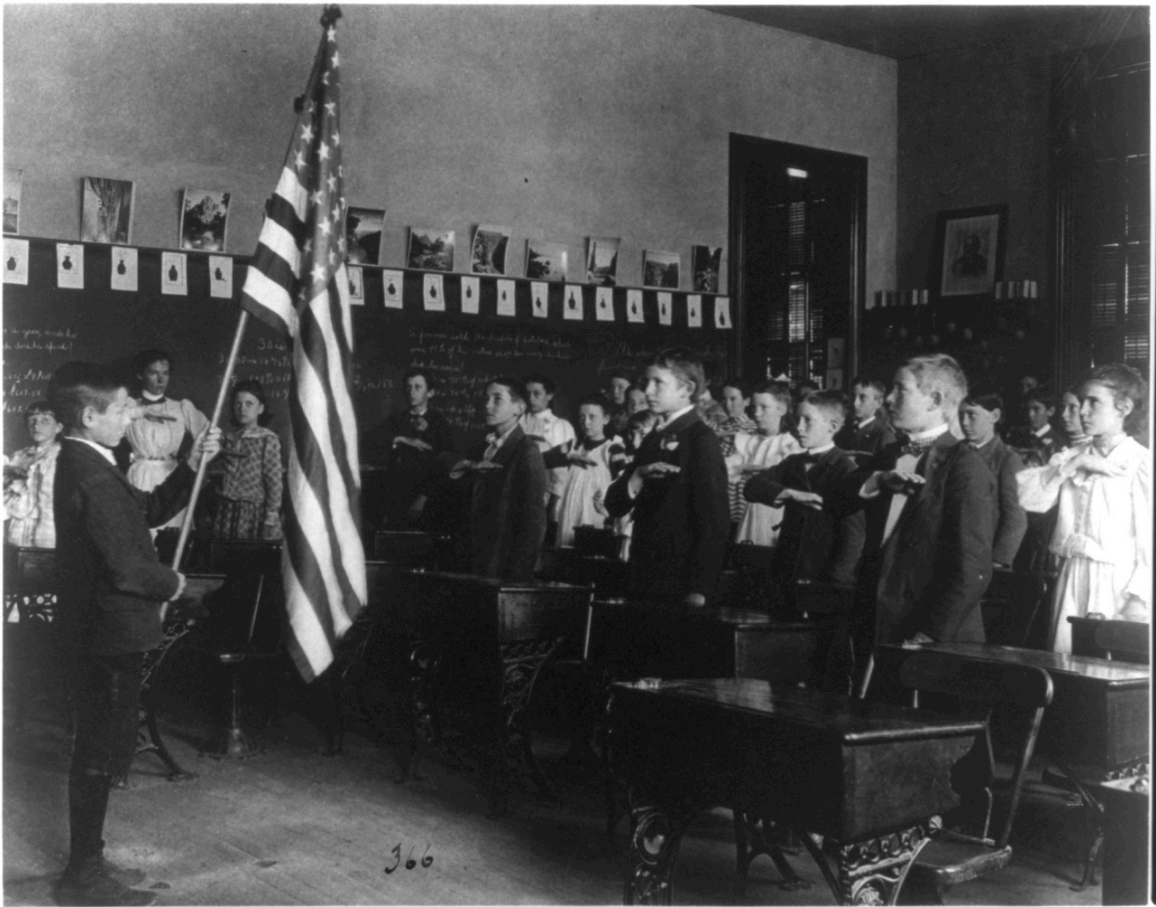
Figure 4. Pledge of Allegiance to the Flag, 8 th Division, photographer Frances Benjamin, circa, 1899. The children in this picture are doing the Balch salute as they say, “We give our Heads! – and our Hearts! – to God! And Our Country!” [ Pledge of allegiance to the flag, 8th Division ]. [?, 1899]