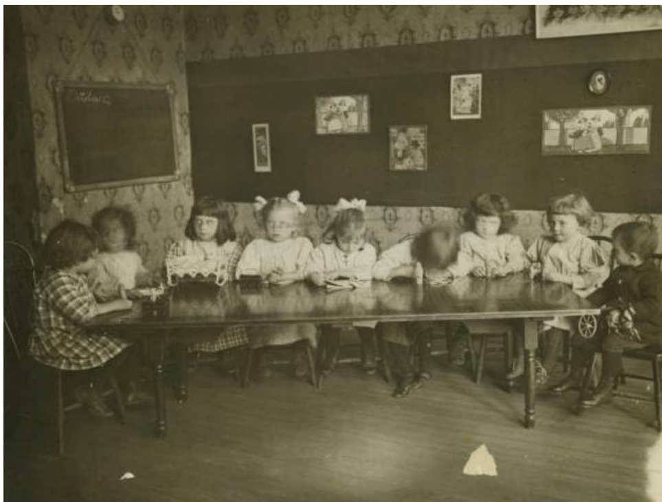
A group of Russian, Austrian, and Hungarian children enrolled in the Indianapolis Free Kindergartens, October 1914.