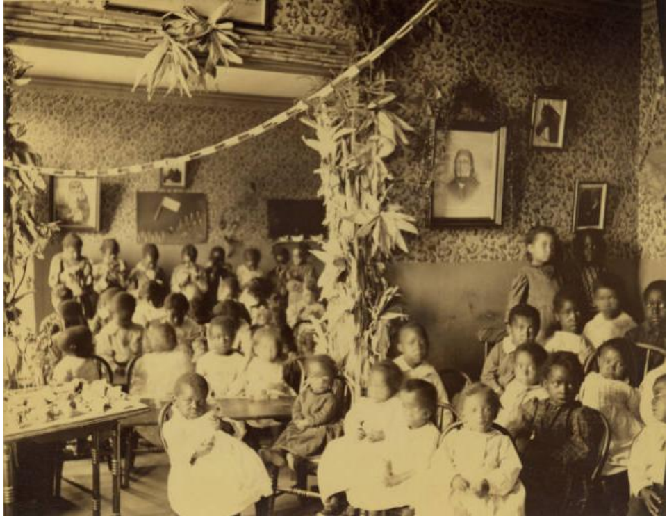
A group of students at the Rhode Island Street Kindergarten in their classroom, decorated for the fall season.