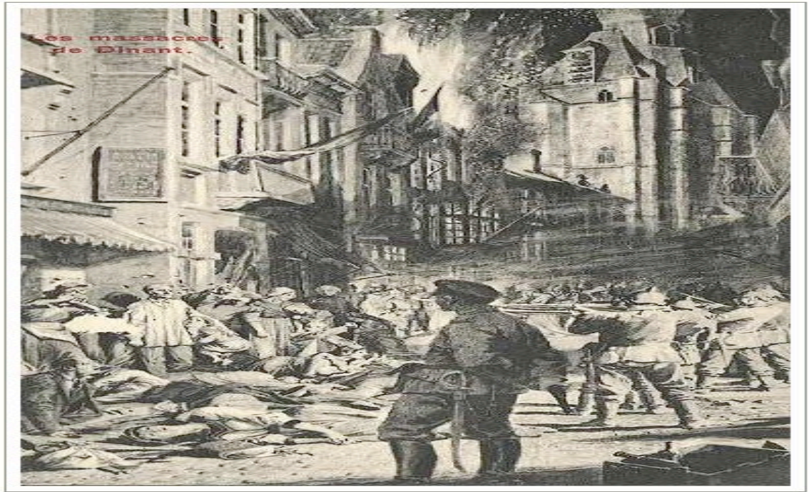
Figure A.2: Post-war postcard