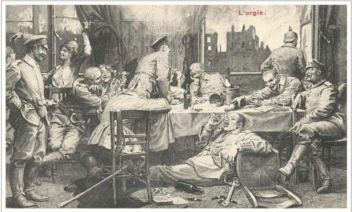
Figure A.4: Post-war postcard