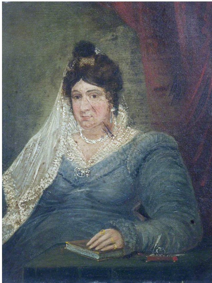
Figure 2 - "Ann of Swansea" 1835 84

neerer cognation with the Soul of man, that is rationally and intellectually.” John Locke noted in his Essay Concerning Human Understanding (1690) that the human form, “as the leading Quality,” defined the presence of one’s “Rational Soul.” If the “Rational Soul” was inseparable from the natural human design, Hatton’s deformity was simply antithetical to “Nature” and “Reason.” 83