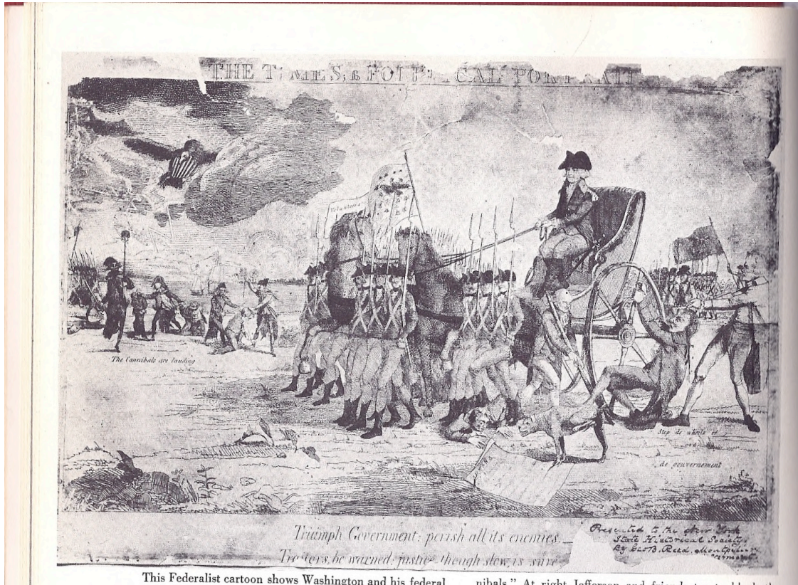
Figure 1 - "A Political Portrait" – 1793

as factions of irate and poor Jacobin sympathizers, the Federalist press propagated the dangers of “democracy” as mob rule, all the while exacerbating American obsessions of conspiracy. 29