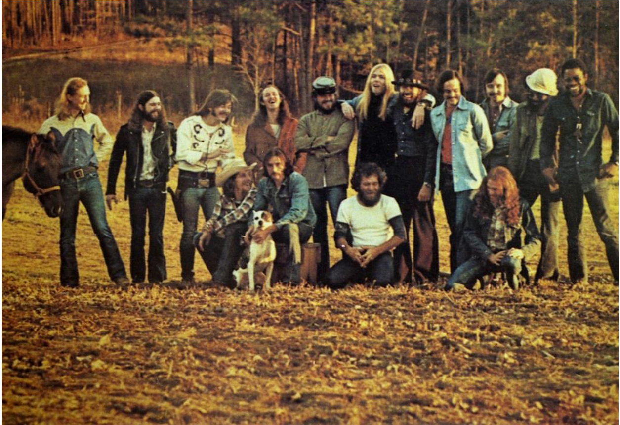
Figure 5. Promotional photograph for The Allman Brothers' Brothers and Sisters (1973).