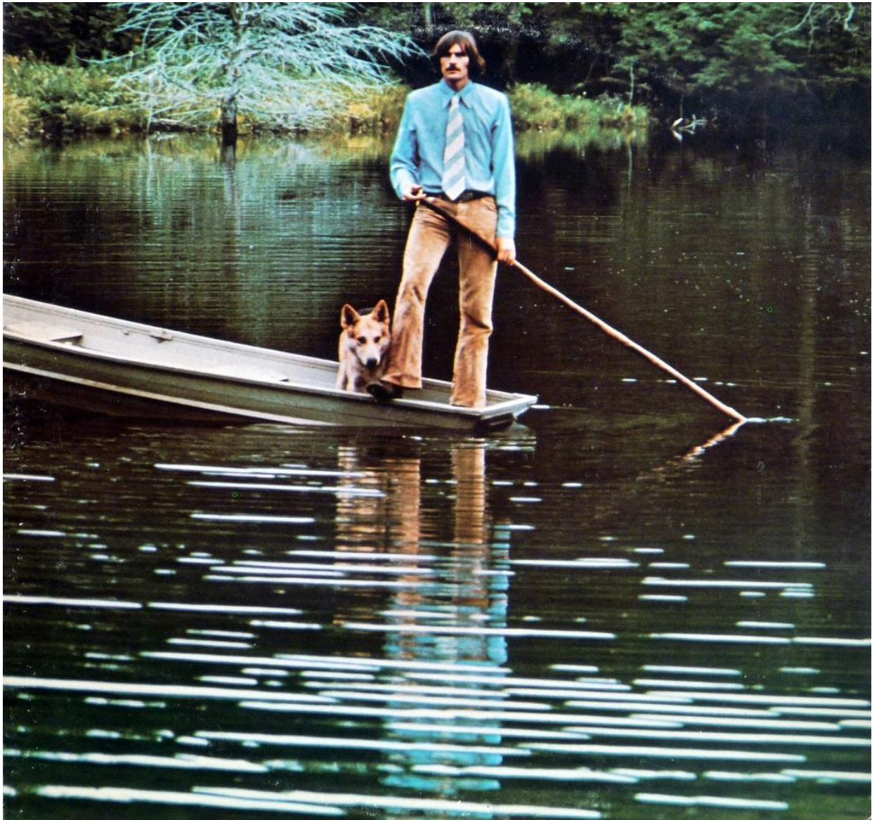
Figure 4. James Taylor's album cover for One Man Dog (1972)