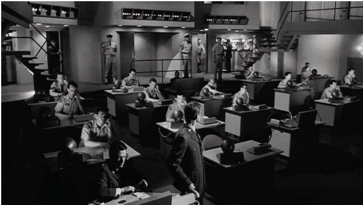
Figure 3. A missile defense command room in Fail-Safe (1964)

The film also notes in detail that people are becoming machines. On this note, there was nothing as clever as the dialogue of Jack Lemmon's C.C. Baxter in The Apartment , though Fail-Safe imagined the secret nuclear headquarters through the prism of Floor 33 at Consolidated Life: