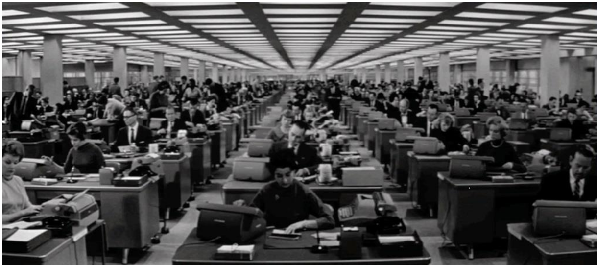
Figure 2. Baxter’s work space in The Apartment

Consolidated. “Joined together into one whole.” Baxter’s identity, as well as those of the others who work at his organization, have been subsumed into the organization for which he works. In fact, the translation of people into quantifiable units occurs in the first words of the film, a monologue spoken by Baxter while the audience views a panorama of Manhattan, then a close-up of the office building, and eventually the interior of the office.