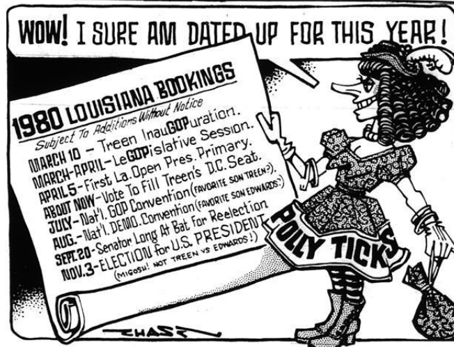
Figure 4: From the February 21, 1980 of The Concordia Sentinel , this Cartoon by John Chase illustrates the multitude of political elections Louisiana faced during 1980, supporting the hypothesis that Louisianians were election-weary by the time of the primary.

The low turnout in the Louisiana primary led many pundits to predict a similar response to the general election. With Reagan's extensive campaigning during the general campaign season, however, voters became enticed by the California governor's conservative messages and, therefore, proved these pundits wrong by netting a much higher turnout, even higher than the national average.