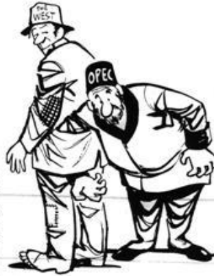
In the News

his district. He's not leaving many stones unturned around the Alexandria area either. In the House South Louisiana is represented by John Breaux, Sonness Moore, Bob Livingston and Lindy Boggs, but the pivotal district is Long's Eighth, which borders both South Louisiana and North Louisiana. Long will be in the hot spot, since the death of Sen. Allen J. Ellender, U.S. Sen. Russell B. Long has been the senior member of the delegation. He faces re-election this year. With Treen stepping down to become governor, Gilda Long and Lindy Boggs have been around Washington longer than any of the rest. But Bennett Johnston has been there now eight years, and he, too, is beginning to feel the spurs in Washington. Johnston, still only 45, has surrounded himself with an excellent staff and in time could become the senior member of the delegation. But members of Congress don't go untested in this modern day of American politics. Long is in the days when they went to Washington and were forgotten about by the people. The American people are plugged in to Congress now, and regardless of their records and service members of Congress will have to fight to stay there. In Louisiana the 1980 census will be the beginning of new congressional districts, and that will give the delegation another new look for the decade.