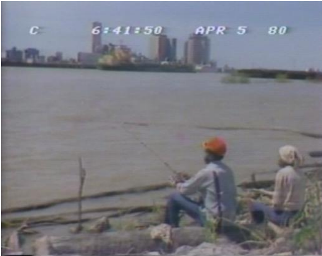
Figure 2: CBS began its primary coverage showing this scene of an African-American couple fishing.

of the primary traded in the stereotypes. Reporter Eric Engberg's coverage begins by depicting an African-American couple fishing on the Mississippi River across from New Orleans (see Figure 2), while he explains that politicians are calling it the "ho-hum primary, as candidates joined with voters in resisting the effort to make Louisiana a major battleground state."