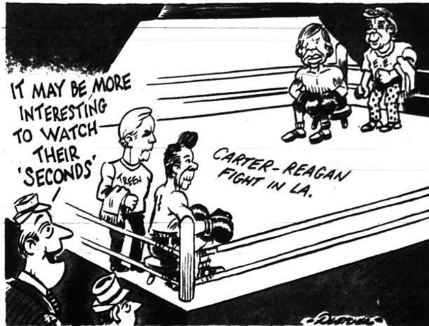
Figure 9: This political cartoon appeared in The Times-Picayune on September 17, 1980 and illustrates how the presidential election served as a “warm-up” between Governor David Treen and former-Governor Edwin Edwards.

Livingston and Henson Moore sided with Despot. 253 Another briefing called the Louisiana Republican Party “not very effective” and noted that Despot did not support Reagan nor did he control his own state committee. Furthermore, the state party had a staff of two people and did not keep a list of registered Republicans. 254