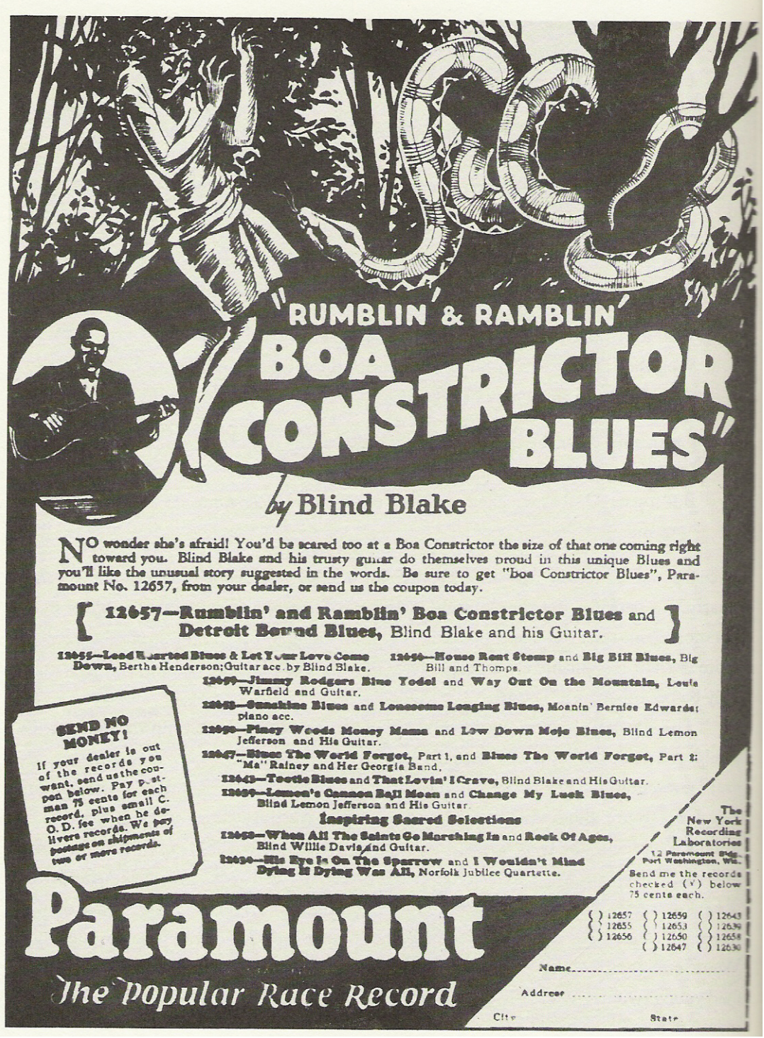
Advertisement for "Boa Constrictor Blues." Chicago Defender 25 August 1928.