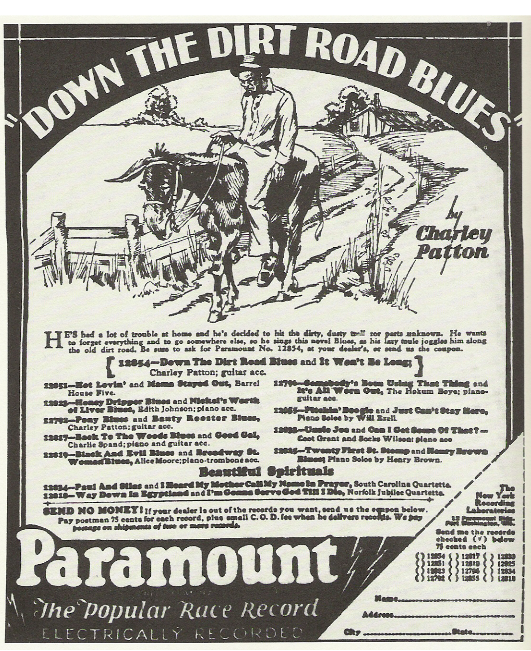
Advertisement for "Down the Dirt Road Blues." Chicago Defender 23 November 1929.