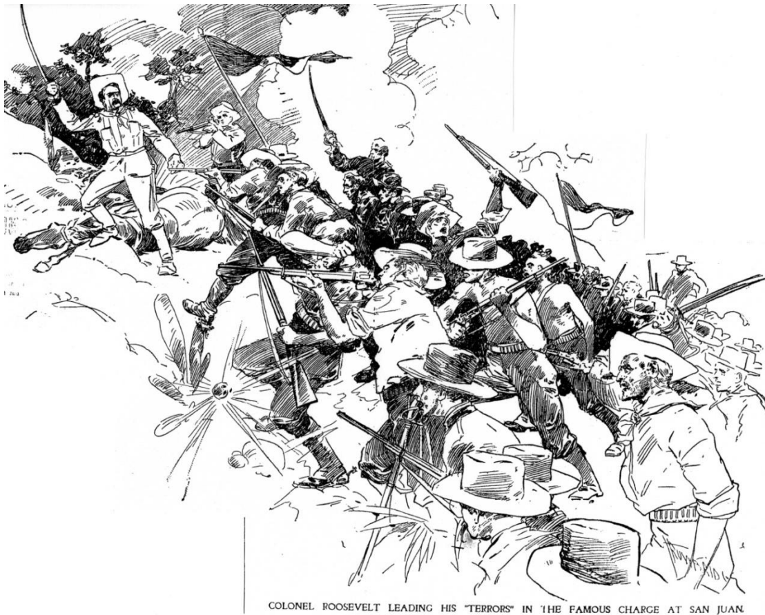
Fig. 2: Charleston News and Courier , July 24, 1898, 13.

essentially erased any southern need for the antebellum-style cavalier figure.