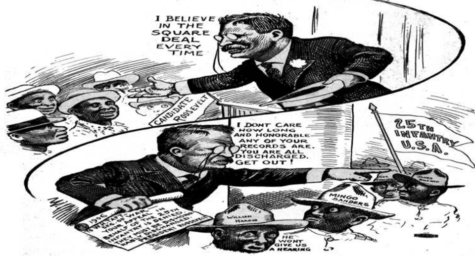
Figure 1. The contradiction of Theodore Roosevelt as a candidate and as President of the United States.

Moreover, Roosevelt's perception on race was considered progressive in 1906. As a progressive New Yorker, Roosevelt believed that blacks, as well as whites, were men. "It is of the utmost importance to all our people that we shall deal with each man on his merits as a man, and not deal with him merely as a member of a given race; that we shall judge each man by his conduct and not his color. This is important for the white man, and it is far more important for the colored man." 51 Yet, Roosevelt was known as a "walking contradiction" who normally vouched on one side of an issue and then later stood on the other side of the same issue. Theodore Roosevelt, a veteran of the United States Volunteers 1 st Calvary, at times, made numerous declarations for and against black troops. He often inferred that black troops depended heavily upon their white officers and