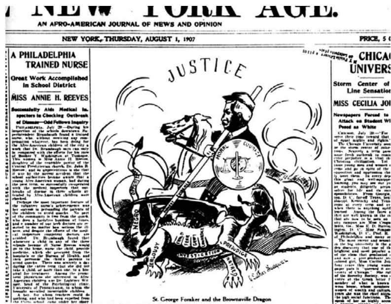
Figure 3. A political cartoon describing Senator Joseph Foraker’s slaying the gigantic Brownsville investigation.

Ohio Senator Joseph Foraker, a 1908 presidential candidate, took up the case for the discharged soldiers and in the process a heated debate began between him and the president. On the senate floor Foraker laid out the facts of the Brownsville incident. He stated that there were only eight legitimate witnesses instead of scores of witnesses that came out of the woodworks to convict black soldiers. He looked for evidence that confirmed the soldiers’ guilt and found none.