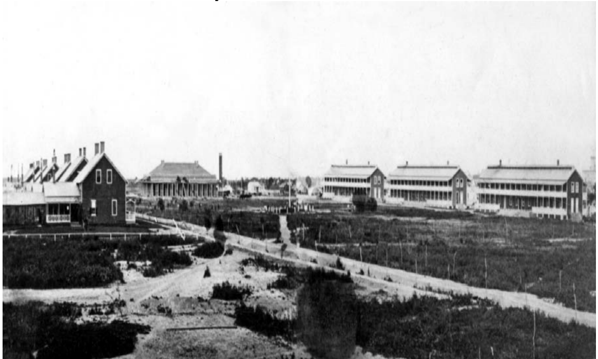
Figure 6. An angled shot of Fort Brown in 1906. Major Penrose's quarters are located in the center of this photo.

disappearing for the next two and half hours. According to court documents, Macklin ordered the trumpeter-of-the-guard to wake him at reveille at 5:00 a.m. This is important to understand, due to the fact that if any situation arises at the fort, the trumpeter-of-the-guard must play “call-to-arms” to alert the soldiers in the fort that they are under attack. If the trumpeter-of-the-guard is busy locating Macklin or performing some other mundane task and the fort comes under attack or duress, then there will be no one to notify the soldiers. 65