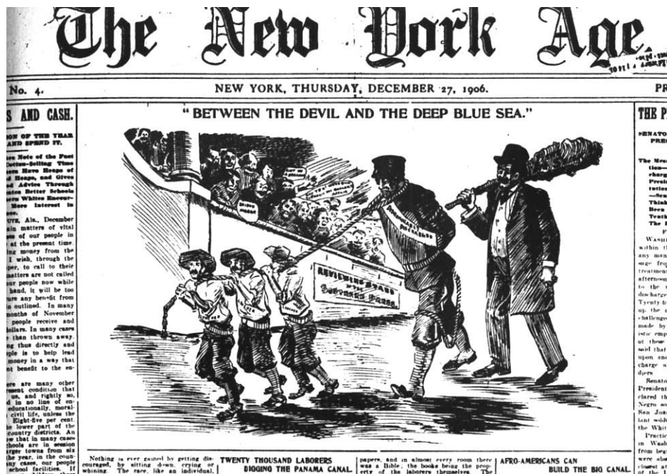
Figure 2. Political cartoons in the black press expressing dissatisfaction about the incident in Brownsville. Courtesy of UT-Brownsville Southmost College.

Sergeant Holliday charged that Roosevelt's comments were uncalled for, uncharitable, and ungrateful. 57