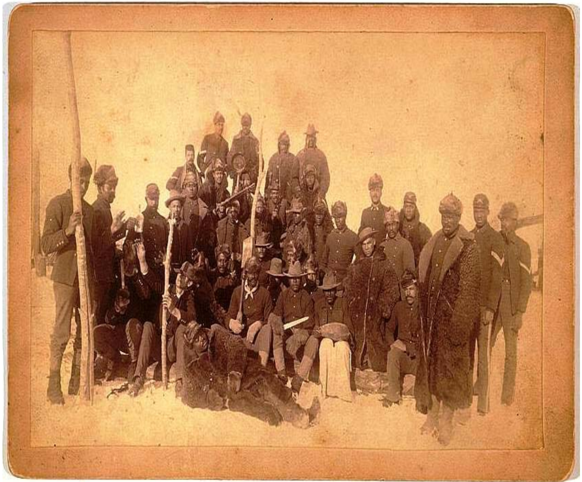
Figure 9. The 25 th Infantry poses for a photo.