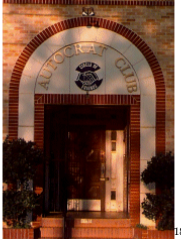
Figure 2. Autocrat Club Symbol and Present Building Doorway

A new constitution and by-laws were adopted as well as a new name. The Autocrat Club became the Autocrat Social & Pleasure Club. Under the new constitution the club's goals were to "promote social intercourse, harmony, enjoyment, refinement of manners, and the moral, mental and material welfare of its members." Club membership was open to men eighteen and older who were of good moral character. The club remains active after ninety-three years. The presidents of the club were all Creole men who lived in the Seventh Ward. The chart below shows biographical information of the past presidents of the Autocrat Club. The information, collected by the 1910-1930 United States Federal censuses, describes the men as mulatto. However, on the 1930 census their description is changed to Negro.