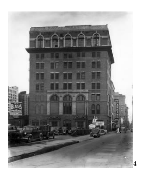
Figure 4. Pythian Temple Building

The newspaper's first office was located in the black owned Pythian Temple building at the corner of Gravier and Saratoga (now Loyola Ave.) Streets. The Pythian Temple building, the only black owned building of its size was home to many of the civic and social organizations in New Orleans. It allowed members of the black community to organize and congregate in an atmosphere free from white involvement. These organizations often shaped issues in the black community providing the Louisiana Weekly with easy access to report on agendas and platforms.