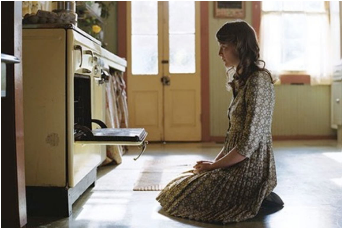
Figure 5: Vice Magazine's (2013b) "Last Words": Sylvia Plath

about-to-ness of the oven (Figure 5) of these images are the readable codes for whom is being depicted. The punctum, the contingency that disturbs the stillness of these images, that strikes me as a viewer is the eyes of the models. Whether closed in an almost cathartic pleasure, lost in a reflection on everything that has lead to the noose, or intently staring into the infernal machine, there is the hint of internalized performance in these models' eyes that invites the viewer to take the very same journey that these models contingently may be taking.