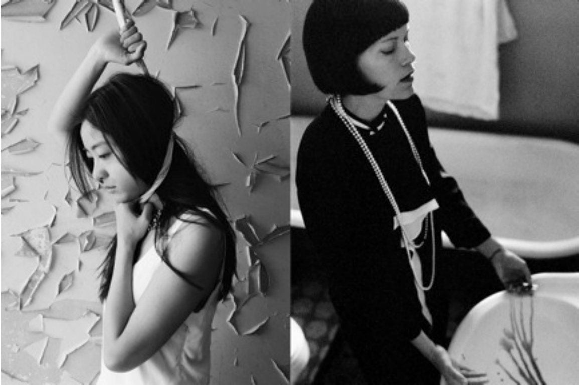
Figure 4: Vice Magazine's (2013a) "Last Words": Novelist Sanmao (right) and writer Dorothy Parker (left)

In the context of Zelizer's (2004) subjunctive contingency and Barthes' (1981) studium and punctum , these images of these models performing are exceedingly fascinating. They do not capture the typical "about-to-die" moment that Zelizer outlines. No one is about to die in these images other than perhaps Barthes' sense of a photographic death. These images stand-in for the suicides they depict. What protects these models is the studium of fashion. For the viewer, the elements that give way to Barthes' "third meaning" as described by Zelizer are those informational and symbolic elements that are easily read. The viewer can know through captions and methods who is being depicted. The viewer can look at the fashion concept and outline an understanding of what the fashion is attempting to impart. The models are protected by the fact that they are not actually performing suicides; rather, they are performing fashion. What one might think is the punctum of these images is not. The blood, the noose (Figure 4), even the