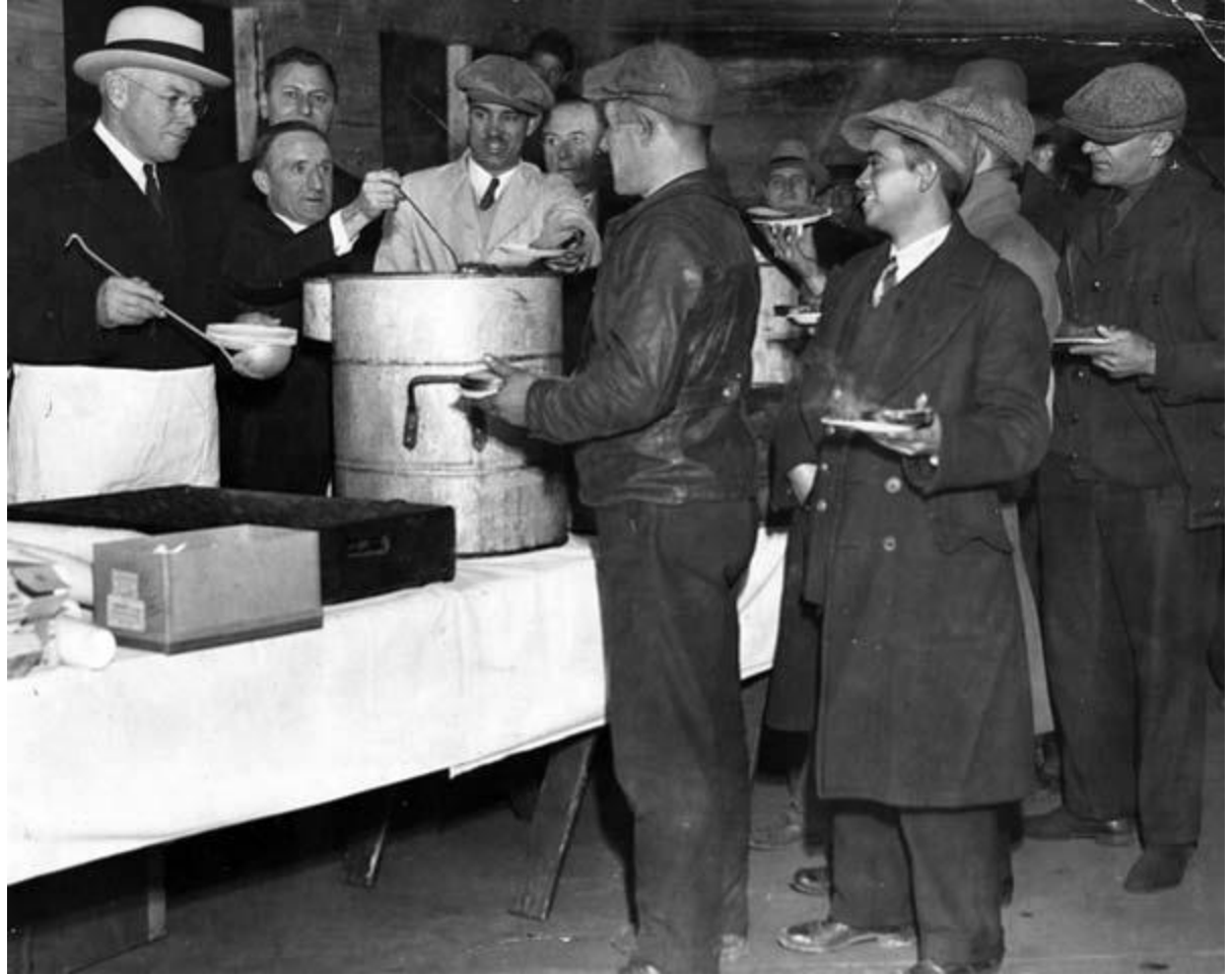
Figure 1. A depression-era soup line, shown in the 1930s.