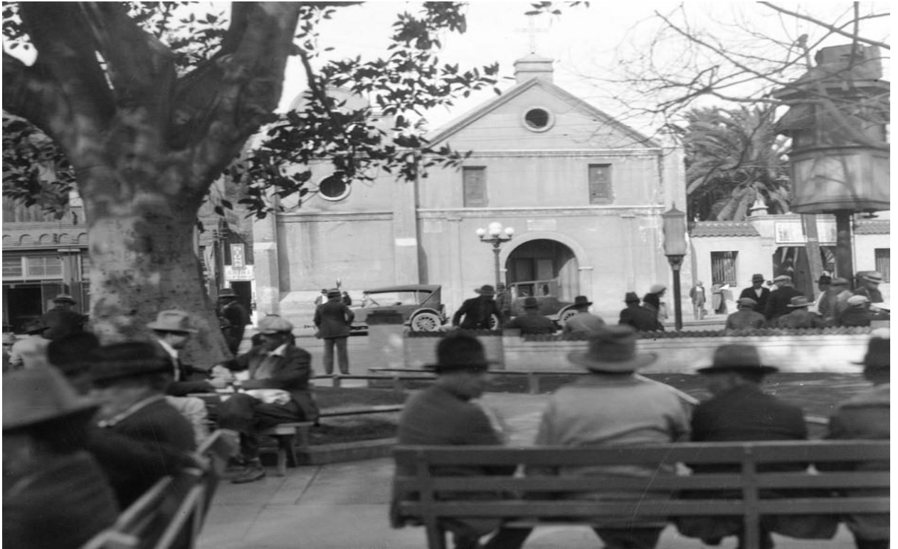
Figure 6. Pershing Plaza circa 1930s. Nathalie Boucher 2010

At the heart of any discussion of urban revitalization is the issue of public space. A prime example for Los Angeles that displays the historical contestation of space and its various constructions based on period-specific ideas of space can be seen in a 5-acre park smack dead-center in the downtown. Bounded by Olive, Hill, 5th, and 6th streets, with the front of the Biltmore Hotel on one side, the office towers of Bunker Hill on another, and the vibrant urban core of the downtown on the other sides, sits Los Angeles' answer to New York City's Central Park, Pershing Square. The park was constructed in 1866 as La Plaza Abaja, "the lower plaza." "After the turn of the century the square was redone in the formal Beaux-Arts style by John Parkinson, the architect of City Hall a few blocks away. In 1918, it was renamed for John 'Black Jack' Pershing, the victorious American