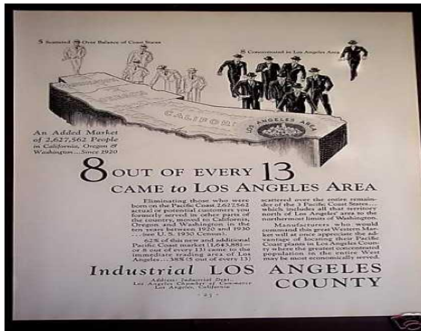
Figure 2. 1930s Los Angeles Chamber of Commerce Advertisement

Los Angeles attempted to showcase its economic resolve in the face of growing international turmoil by hosting the 1932 Olympics. This event is worth noting for its ostentatiousness due to the fact that no other city even made a bid to host the Olympics. Many nations and athletes were unable to pay for the trip to Los Angeles. In fact, fewer than half the participants of the 1928 Summer Olympics in Amsterdam returned to compete in 1932. Even US President, Herbert Hoover, skipped the event. In addition to this event, Los Angeles would go on to open, in a four-year span, LAX international airport, The Greek Theatre in Hollywood, and the Griffith Observatory as ways to further enhance tourism to the city.