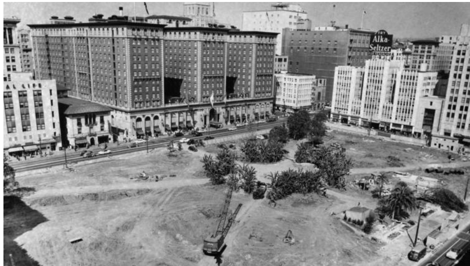
Figure 7. A 1951 photo of Pershing Square shows the clearing it underwent to construct an underground parking garage.

general of World War I. His statue still stands in the park, next to a monument to the 7 th California regiment that fought in the Spanish-American War of 1898. From the 1920s to the 1960s, the square served as the center of what was known as ‘the run,’ a gay cruising corridor along 5th Street stocked with nearby drinking establishments.” 194