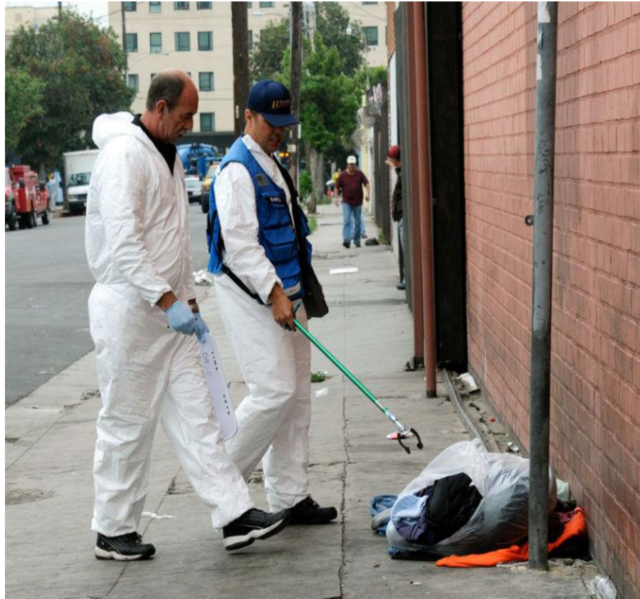
Figure 4. Operation Healthy Streets Workers. LA Downtown News. Photo by Gary Leonard

along with neighborhood business leaders, created a task force called Operation Healthy Streets to implement “cleanup sweeps” in this area.