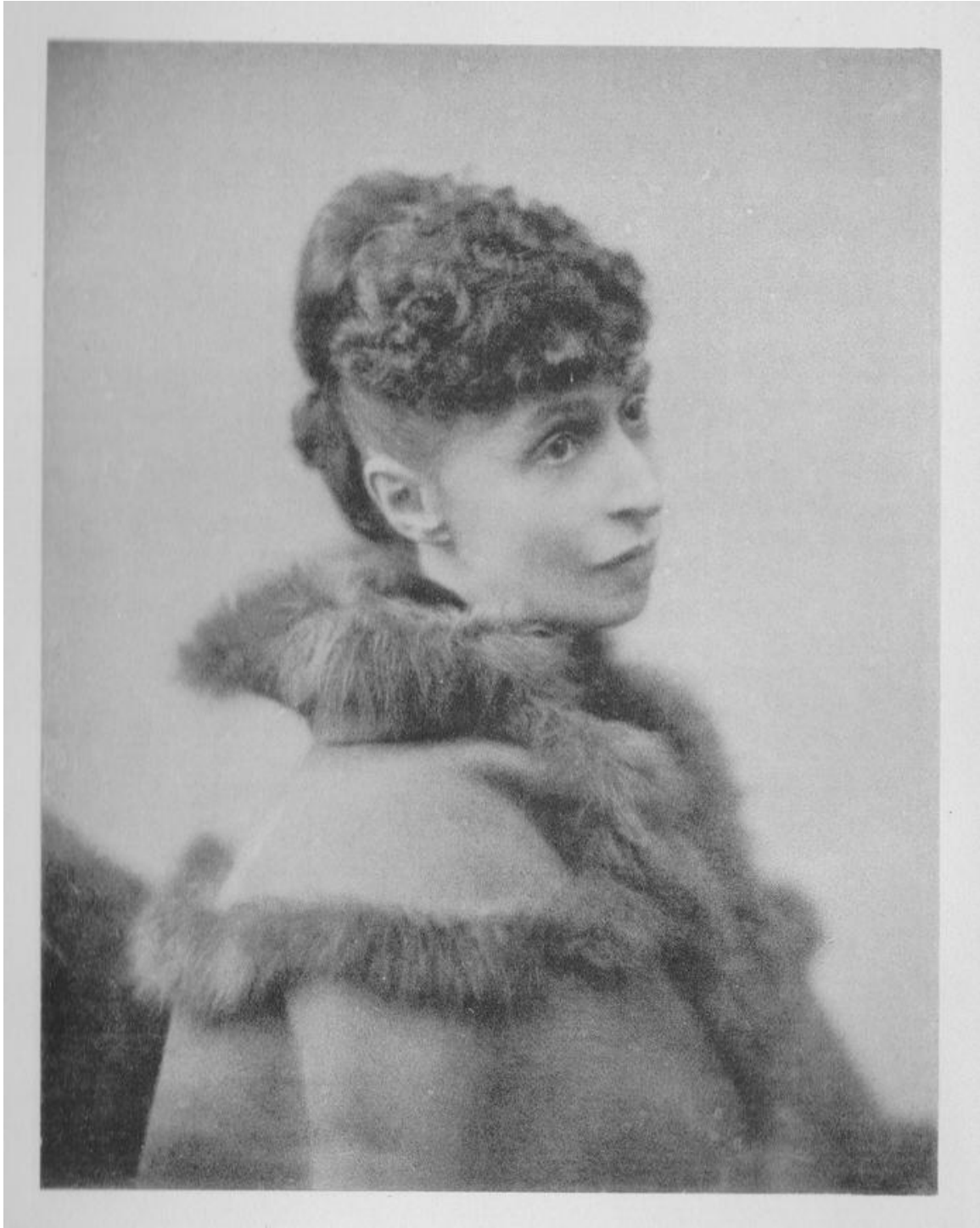
Figure 2. Alice Meynell, frontispiece to Alice Meynell: A Memoir by Viola Meynell (New York: Charles Scribner's Sons, 1929).