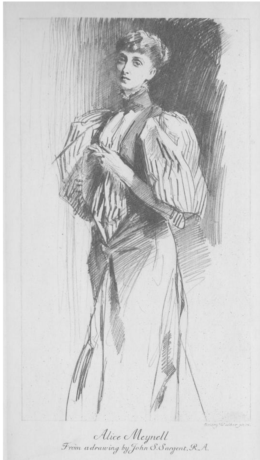
Figure 3. Alice Meynell, frontispiece to The Poems of Alice Meynell: Complete Edition (London: Burnes Oates & Washbourne, 1923). “From a drawing by John S. Sargent, R. A.”