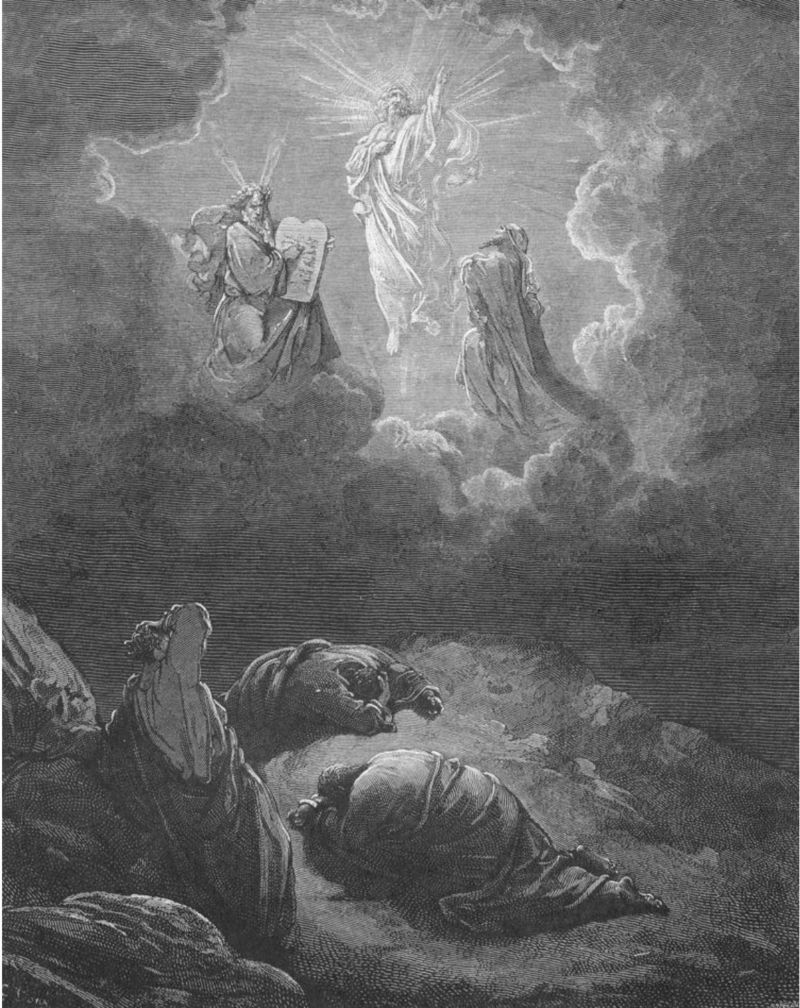
Figure 4. Gustave Doré, The Transfiguration (1866; rpt. in The Bible in Pictures ; New York: William H. Wise, 1937; 355).